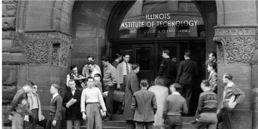
Students in front of Main Building, 1943