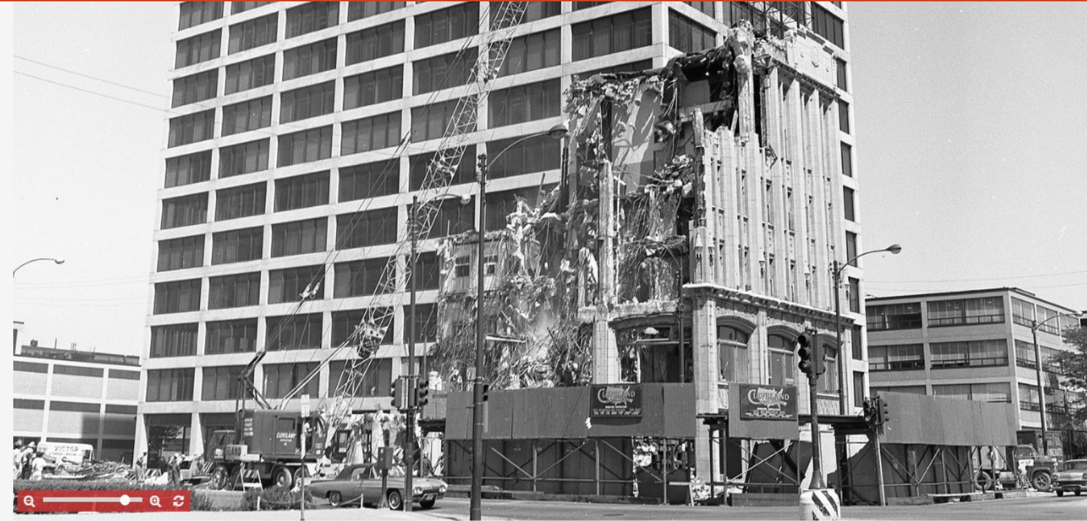
The Arcade Building being demolished, with IITRI Tower in the background