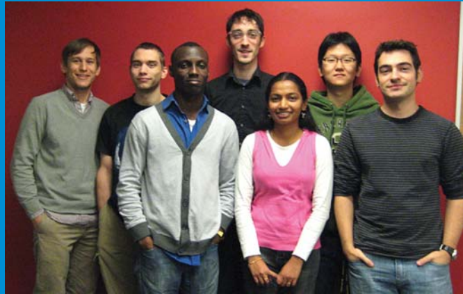
IPro Team: (From Left To Right)