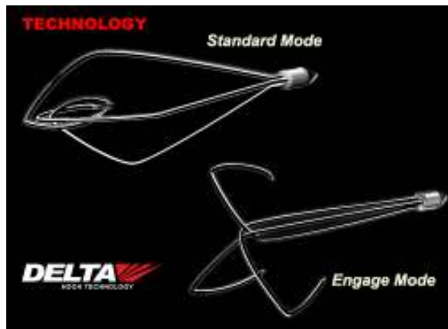
Figure 6. The sponsor's depiction of the fully functioning Delta Hook.