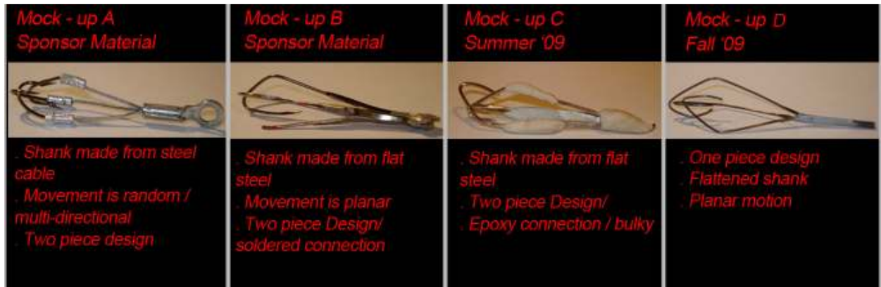
Figure 2. A brief pictorial history of the Delta Hook. Mock-up A and mock-up B are from Mr. Park. Mock-up C is similar to mock-up 1 and mock-up 2. Mock-up D is the current working prototype.

movement of the hooks was prevented by replacing the shank with a flat flexible metal.