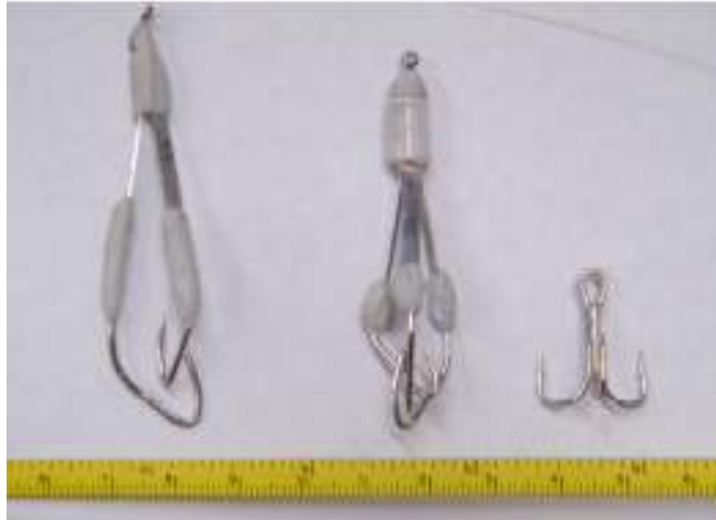
Figure 3. Mock-ups from the Summer 2009 IPRO: Mock-up-1, Mock-up-2 along with a traditional treble hook are shown. Mock-up-1 is a two piece design, joined by epoxy; Mock-up-2 is a two piece design with smaller epoxy joints. The third hook from the left is a treble hook; it is displayed for scaling comparison.

To fix the problem of the epoxy while still maintaining one dimensional bending, the team decided to come up with a new one piece design that avoided epoxy all together. The epoxy need to be removed from the design because the bulky joints hindered the planar motion of the hook.