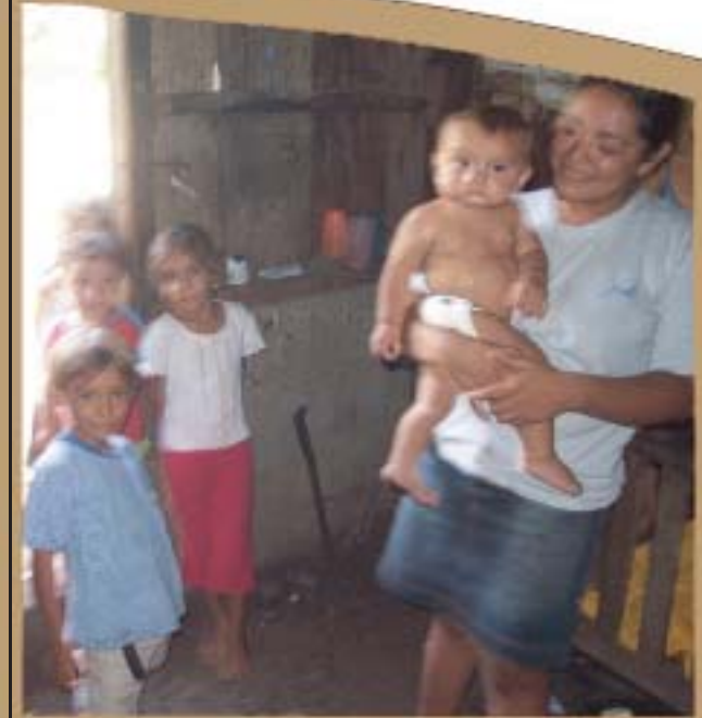
Developing Affordable Solutions for the World's Rural Poor

I PRO 325 Developing Affordable Solutions for the World's Rural Poor Fall 2007