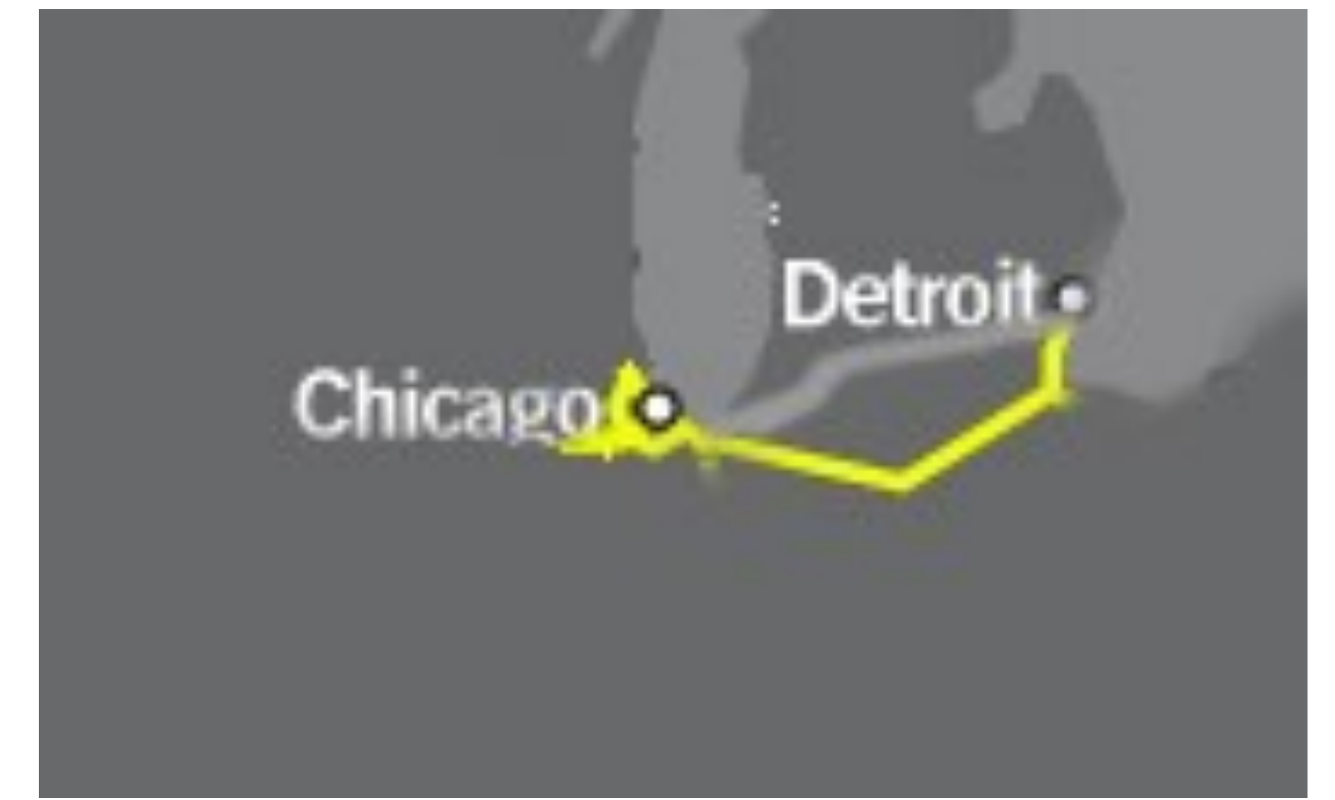
The Chicago Detroit line goes in a different direction than the highway where the Highway goes northeast first then east where as the rail line goes east then north-east