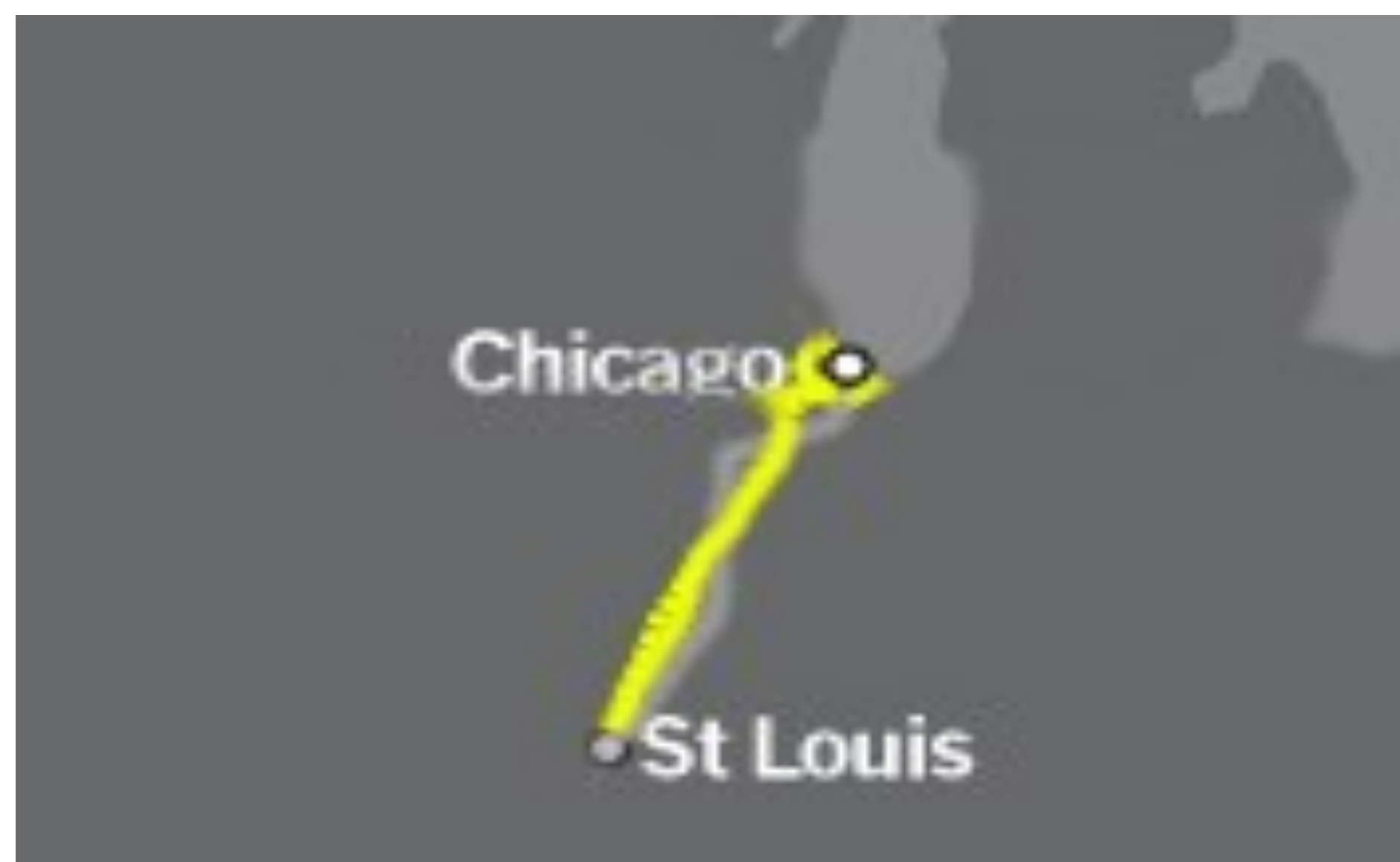
The Chicago to St. Louis track is the set of track that is mainly being looked at for this particular project it has the easiest access to the Intermodal station.