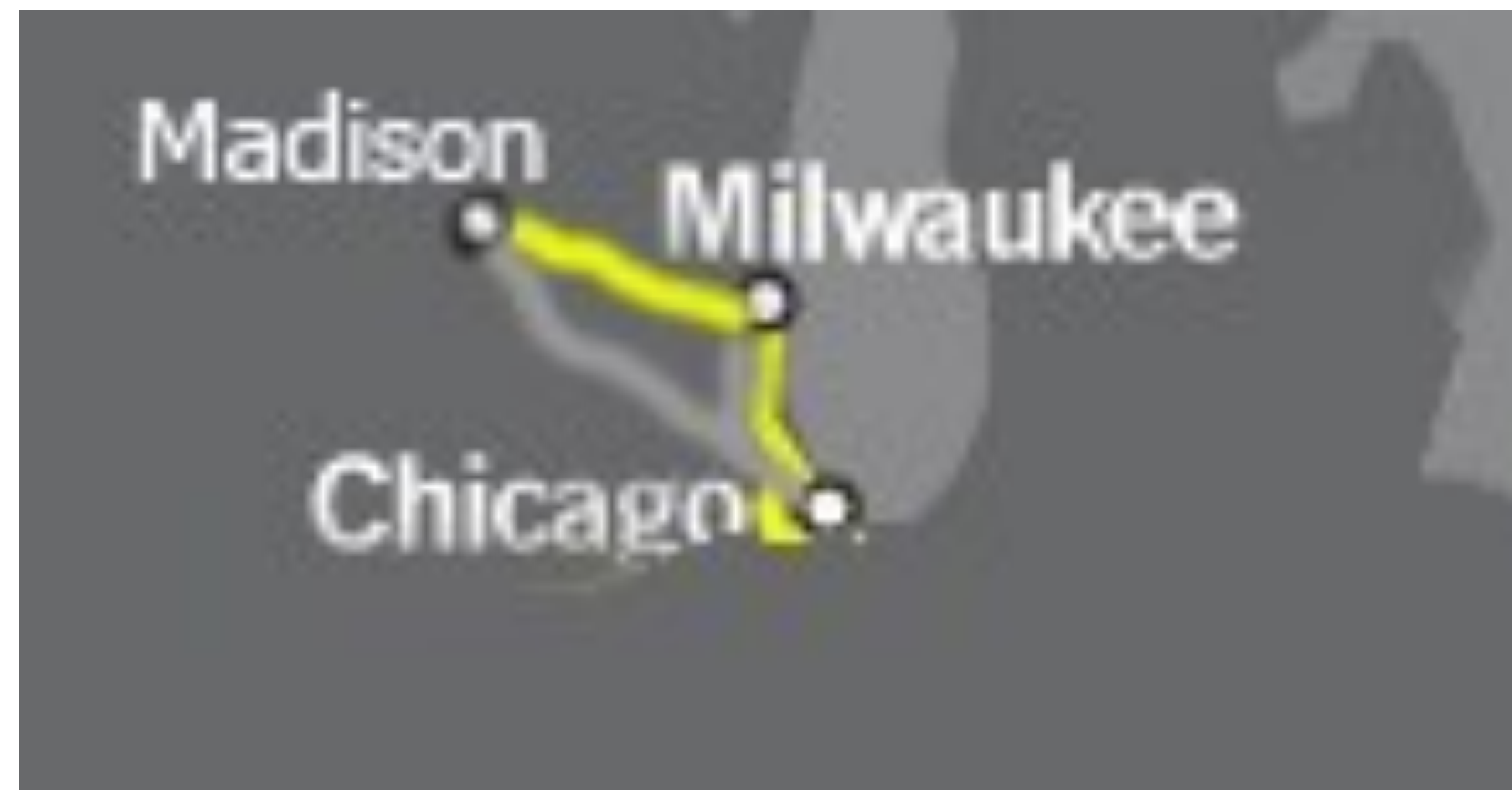
The Chicago Milwaukee-Madison line goes trough Milwaukee first and then to Madison where as the highways go from Chicago either to Madison or to Milwaukee.

This shows the high speed plan for the Midwest along with a time space diagram . The total allotted budget for the entire Midwest was 2.72 billion dollars. Each area has its own specific budget. The Chicago Milwaukee-Madison line received $823 million. The Chicago-St. Louis received $1.133 Billion. Chicago Detroit received $244 Million and the Chicago Quad Cities received $617 million.