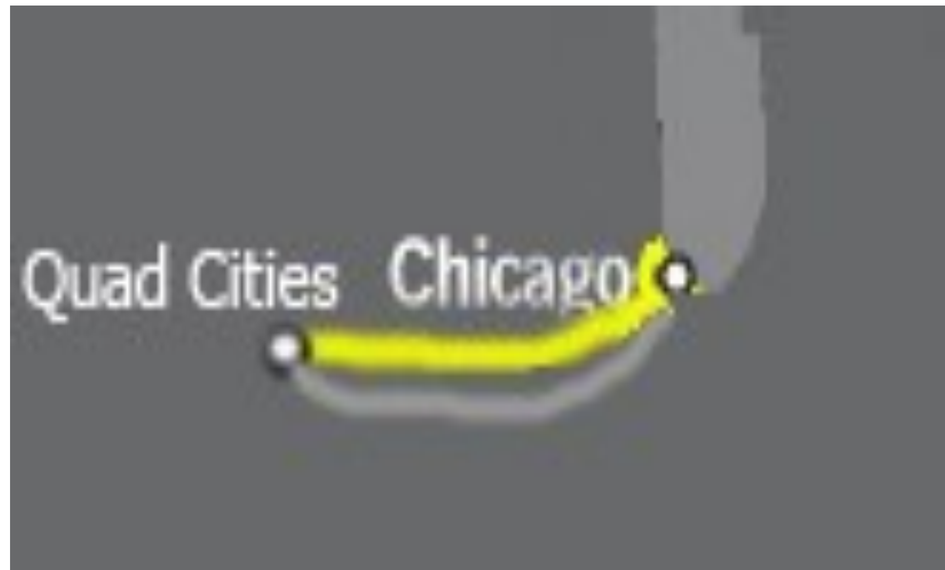
The Quad cities received the most recent funding. This was not on the original funding from the governments 8 billion dollar highspeed program budget