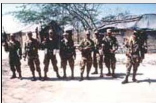
Uninvited visitors to our clinic in the refugee camp.

There is a refugee camp in Barranquilla, Colombia, laden with $40,000 in medical and rehabilitation supplies and now thirteen local medical students who have volunteered to help. It has started with two students at 2004. There was a school build in this camp.. It is typical "third world": cement, wrought iron, no carpet or air conditioning. However, it adds an aura of stability and permanence to the makeshift construction of the one-room hovels squeezed into its shadow. It is more than a building: it is a monument to the future--testimony that there are people on the outside who believe there will be a future. There open structure that will someday serve as a lunch room--if the luxury of regular meals ever becomes a reality. The lunchroom without lunches is empty, except for a small class of children whose desks are bunched into a corner.