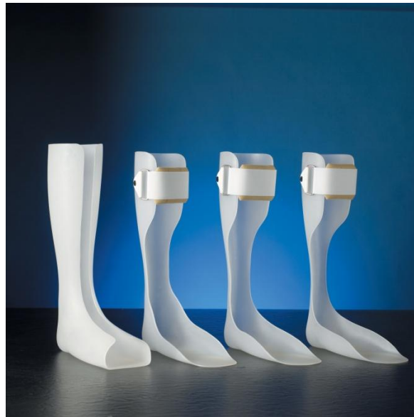
Ankle Foot Orthosis- AFO

It was important to IPRO 309 that not only people in Latin America receive proper O&P care, but that they receive it as soon as possible. Our group first wanted to deal with prosthetics, but we knew this would be too costly and time consuming. For this reason, the group shifted its focus to orthotics, specifically Ankle Foot Orthotics (AFO). These orthoses can take time to make, with the shortest wait being a few days long. The technical group started to think of ways to reduce this time. The first idea the group came across was the creation of a temporary orthotic.