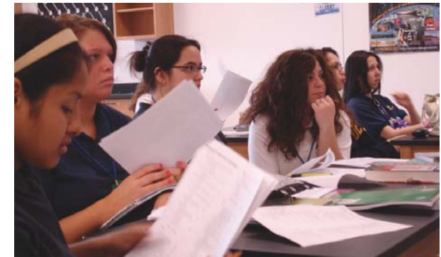
Students discussing their Ecological Footprint