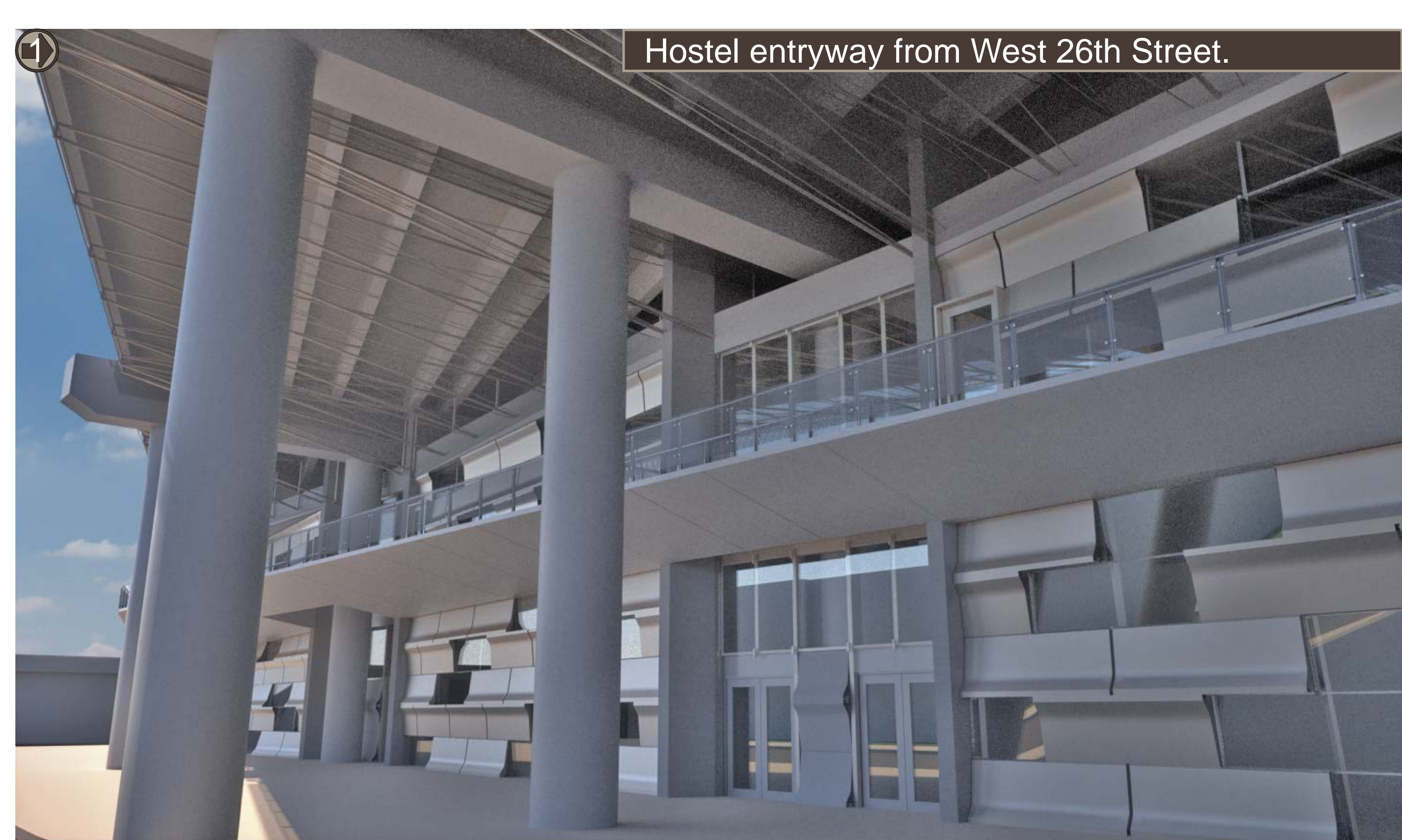
Hostel entryway from West 26th Street.