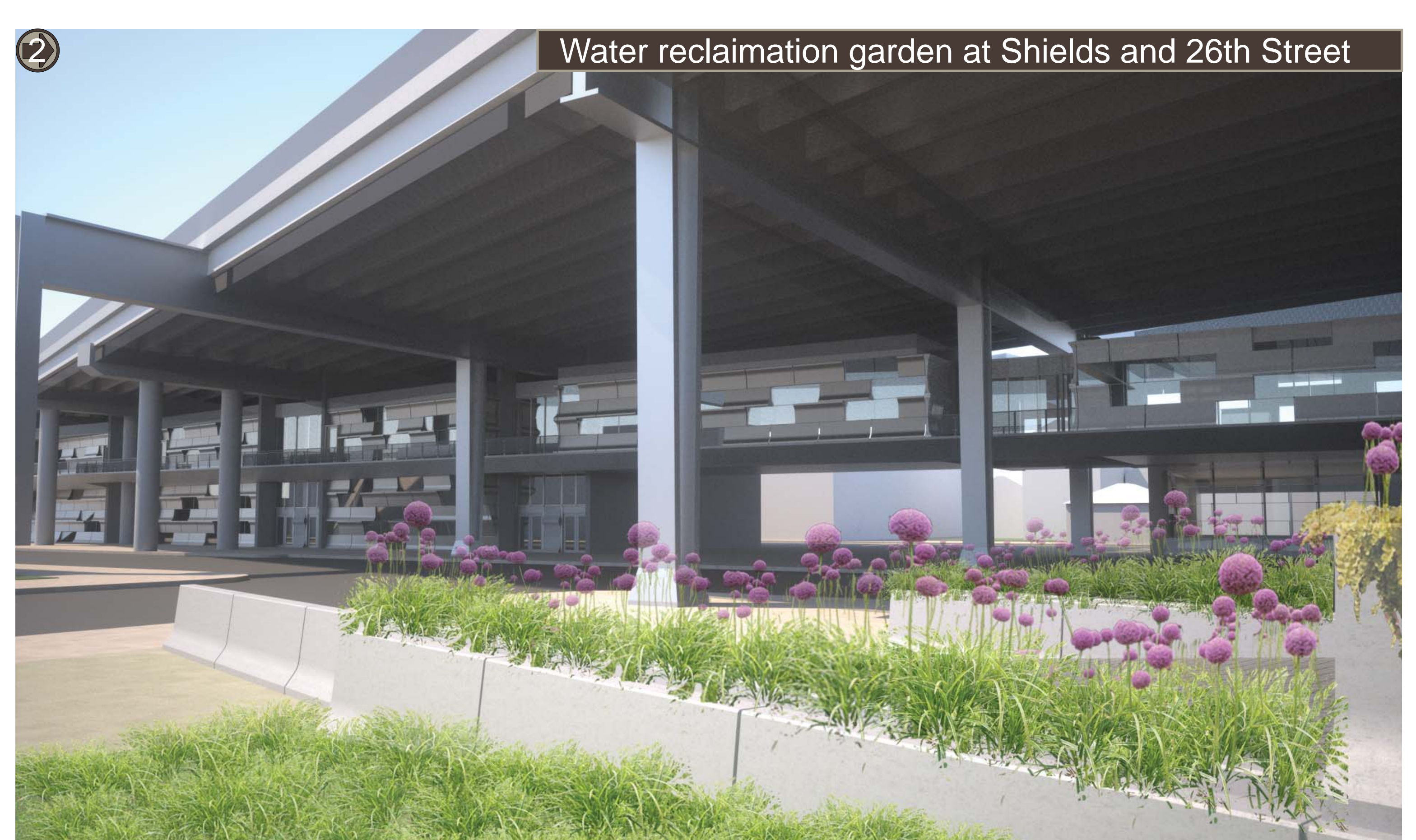
Water reclamation garden at Shields and 26th Street