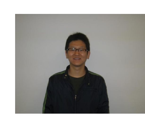
In Seok Sin Poster Designer