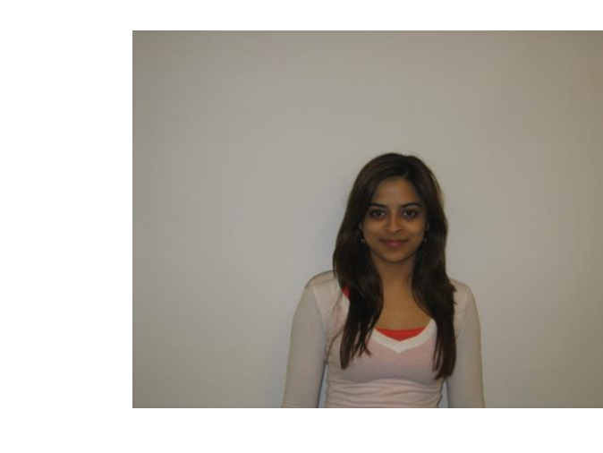
Patel Sabeen Haque Ethics USGBC research