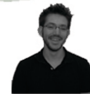
MATTHEW WALCZUK Architecture