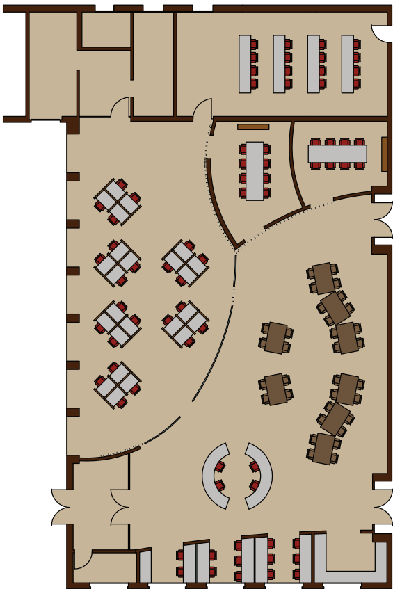
Library Plan (Layout One)