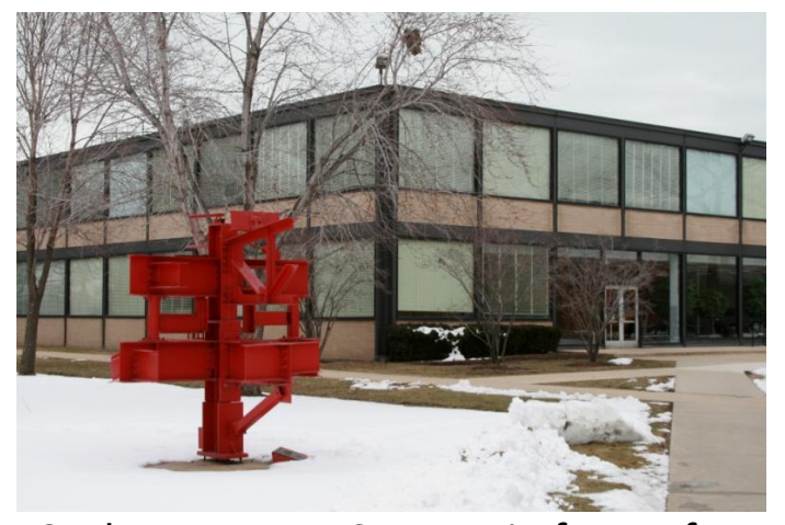
Sculpture on IIT Campus in front of E1 Building