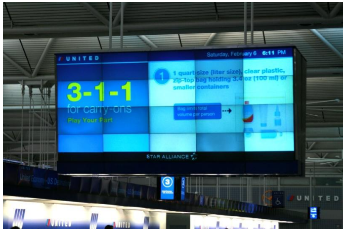
Electronic Signboard at O'Hare United Departure Terminal