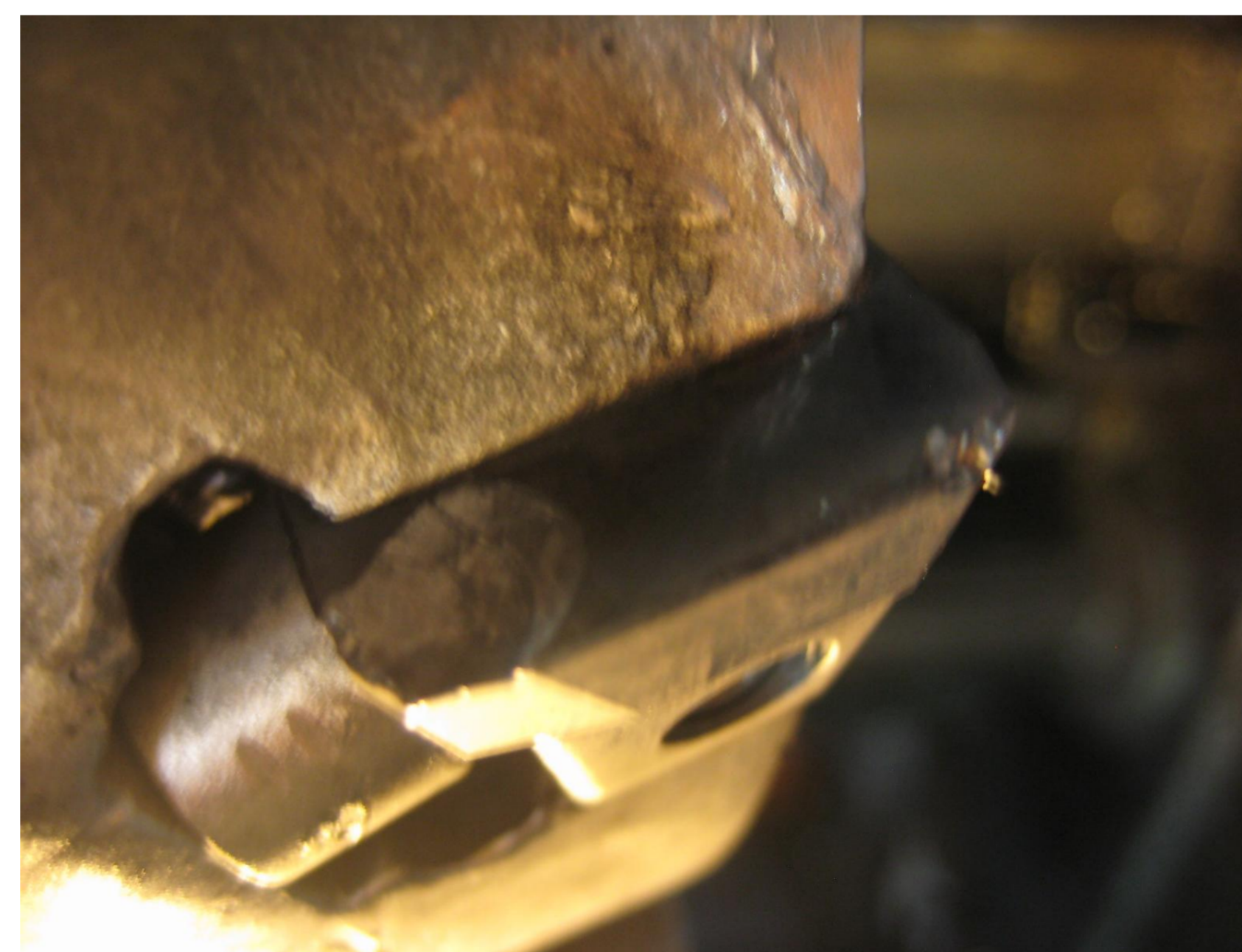
Figure 2: Slightly chipped tooth