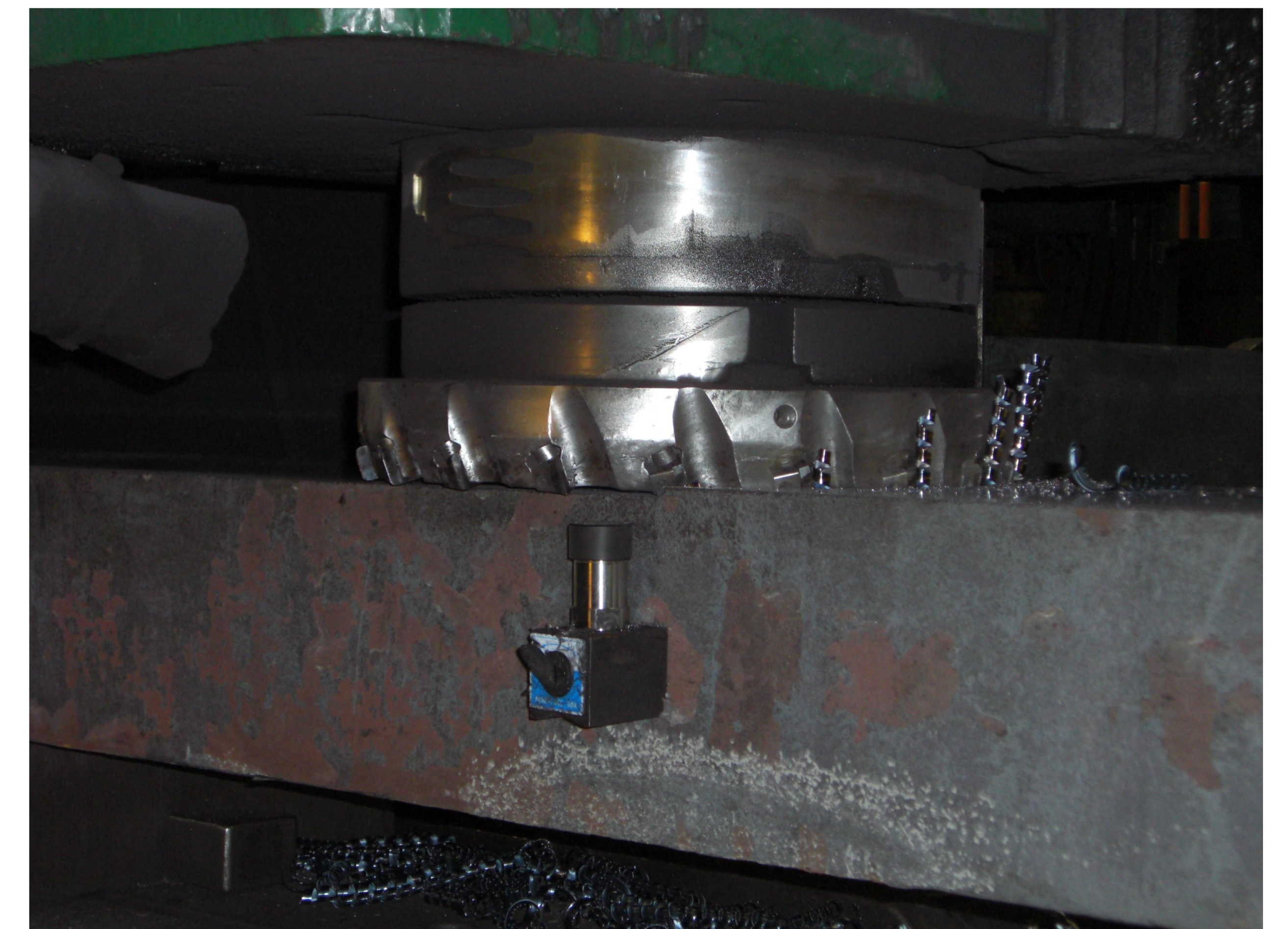
Figure 3: Accelerometer placement during milling process.