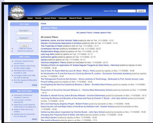
Screen shot of lesson plans

Schools and teachers are under tremendous pressure to improve performance as measured by standard test scores. With tight budgetary constraints and a difficult set of demographics, teachers carry a significant burden which puts a big strain on their personal time and resources. The problem is exacerbated by the large number of new teachers entering the system each year and a high turnover rate. Little time exists in the course of the school day to provide effective face-to-face mentoring or for established teachers to share best practices, class management techniques, etc. with each other. Continuing education courses are highly treasured for their networking value, but these are few and far between in the normal course of one's teaching career. The problem begs for a virtual solution.