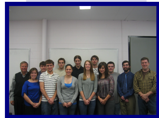
Teacher Knowledge Share Team Members