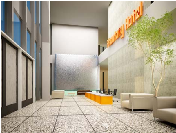
View of Lobby

IPRO 315 is an ongoing project. This semester the students were asked to use their skills as architects and engineers to modify a structure created by the previous semester's designers. The group was given a similar frame design from an existing hotel in Chicago, IL. An architectural re-creation of the original Phantasy Hotel and a computer analysis of the structure were made to select new materials for construction of the tower. At the end of the semester, the architects and engineers are to have completed drawings that can be sent to contractors and developers for construction.