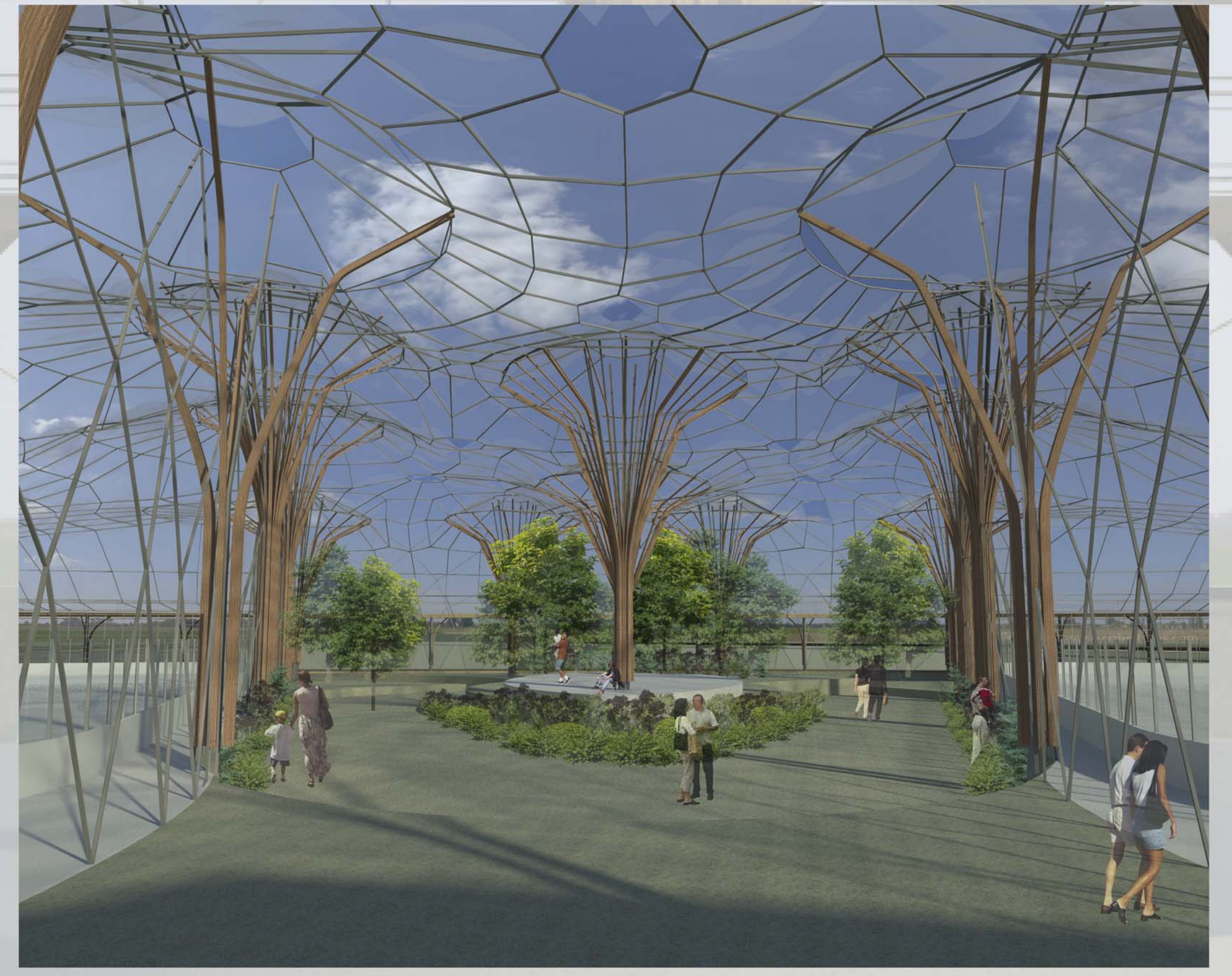
ATRIUM FROM BUILDING NODE