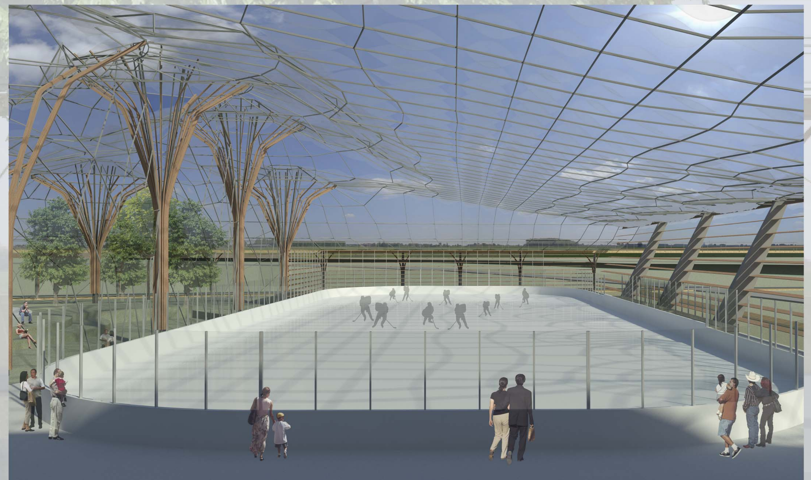
MULTISEASON RINK VIEW FROM SECOND LEVEL