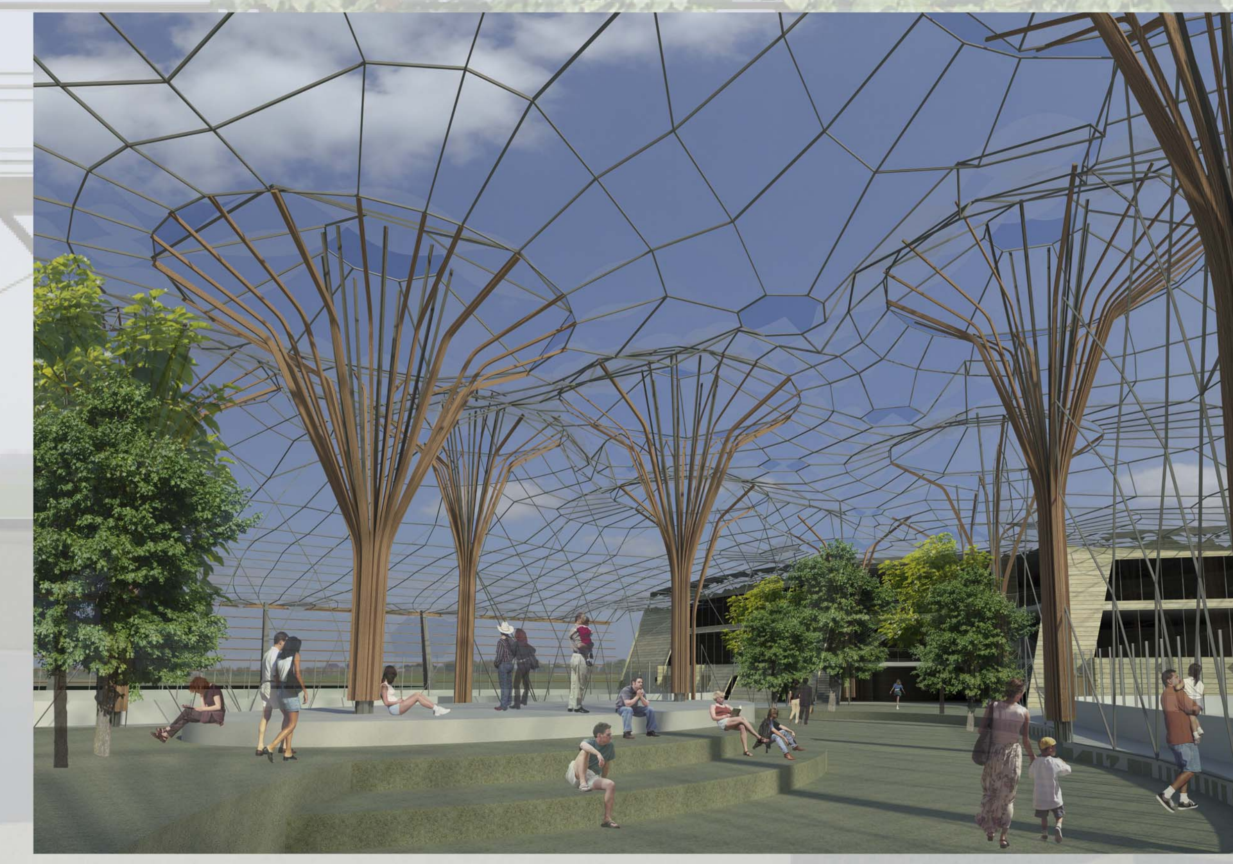
ATRIUM SPECTATOR AREA