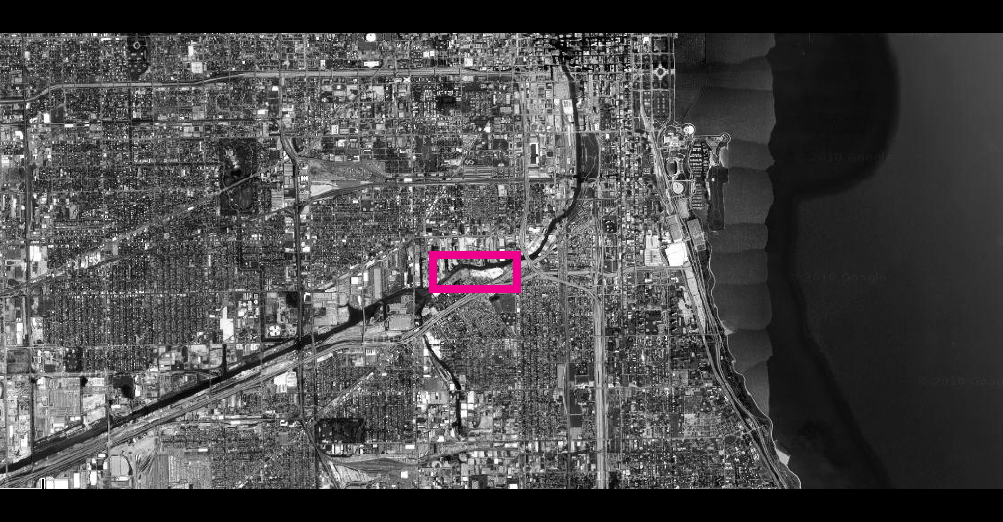
Bridgeport, Chicago IL