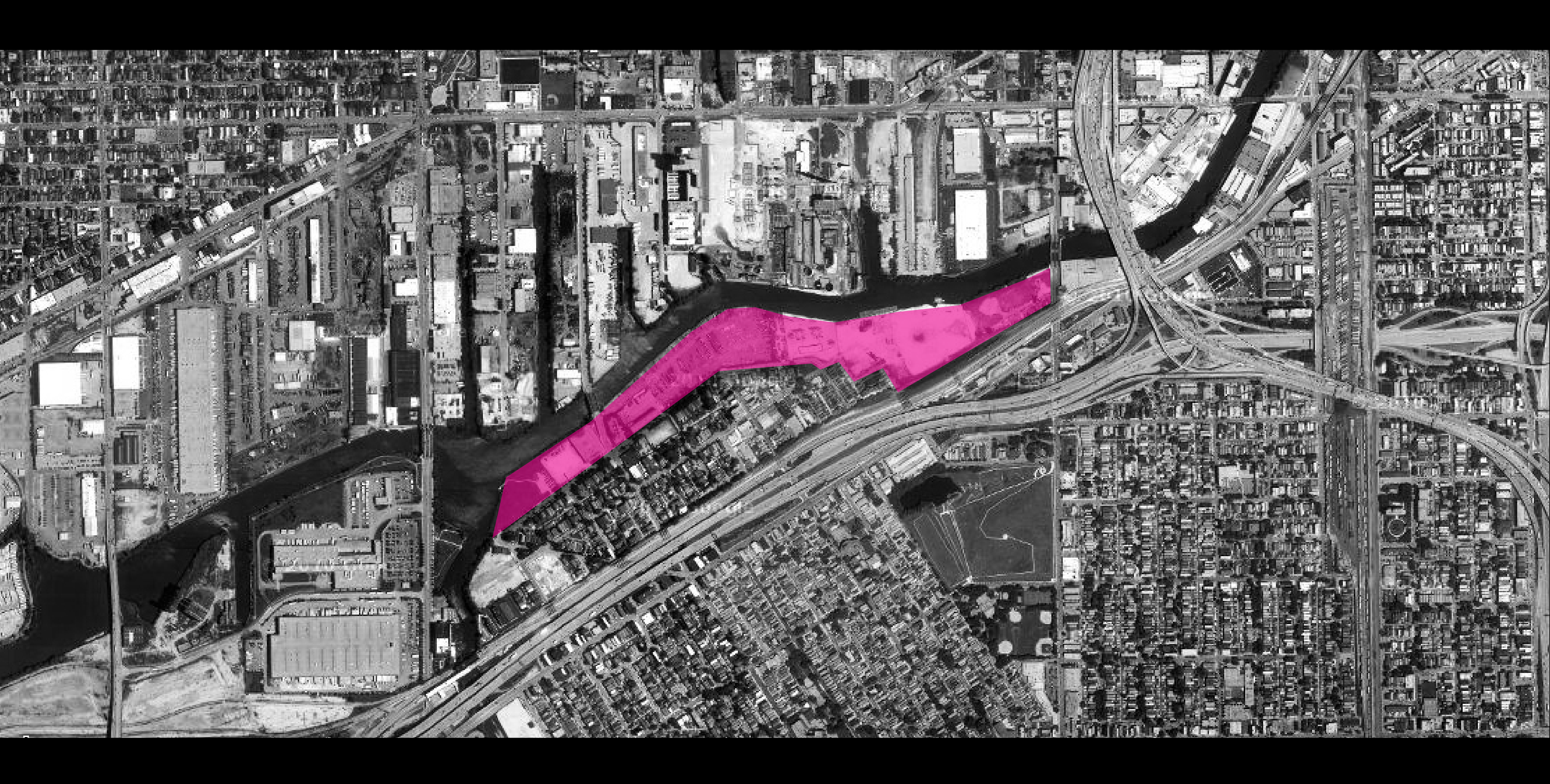
Bubbly Creek, Bridgeport, Chicago IL