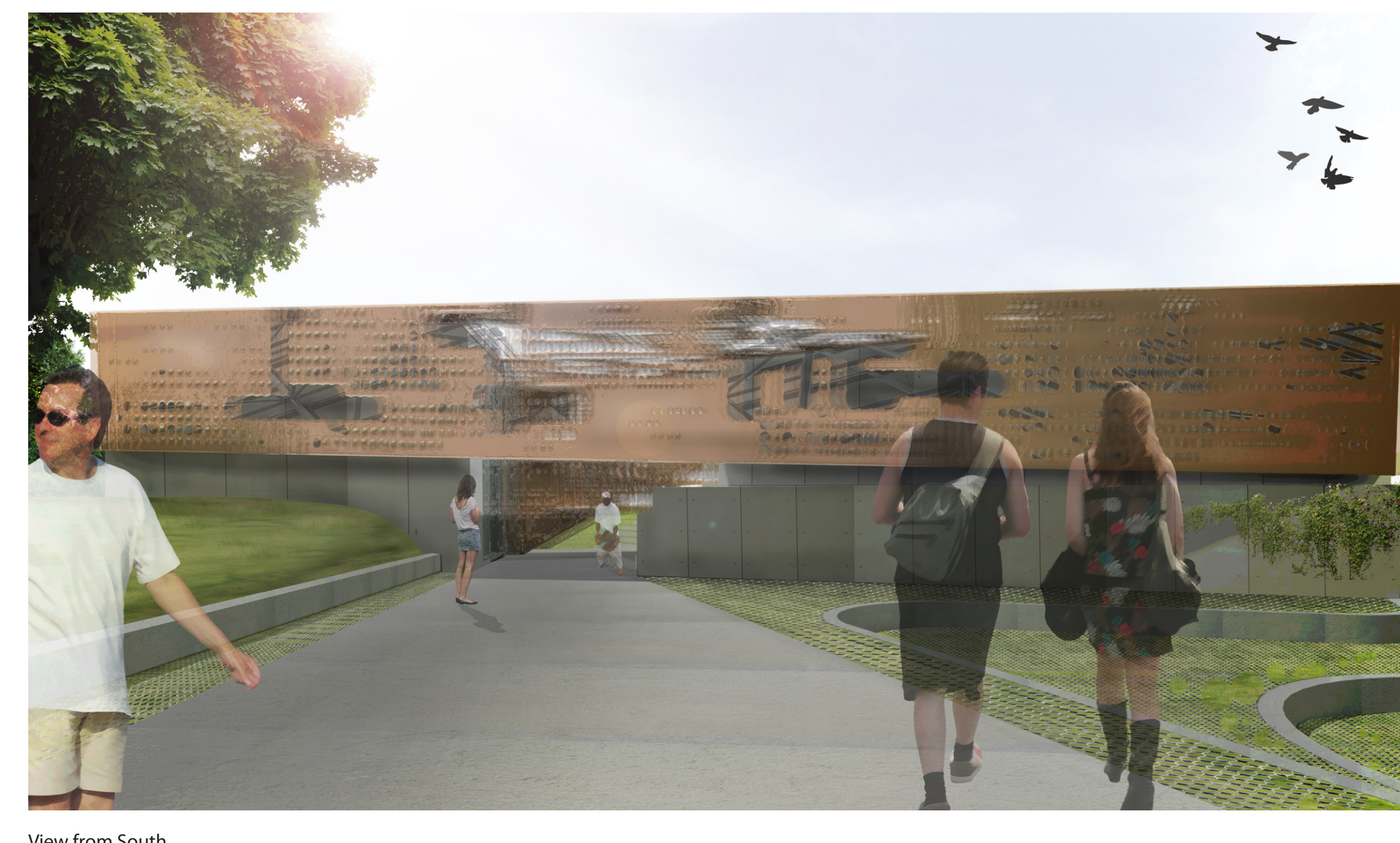
View from South