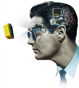
Fig: A picture of an idealized prosthetic design. The brain works to represent things in terms of orientation, texture, and color.