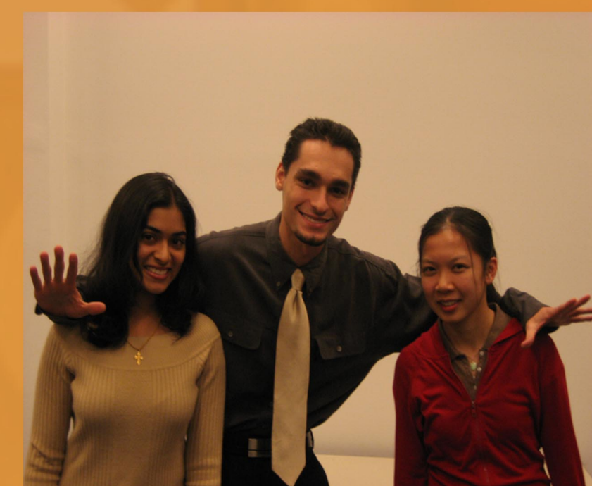
Friendly IPRO members

Finally, the week-long testing period is concluded and the participants return to IIT for a final affective recall test and return their PDAs.