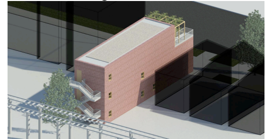
Rear of building.