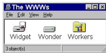
The WWWs Widget Wonder Workers