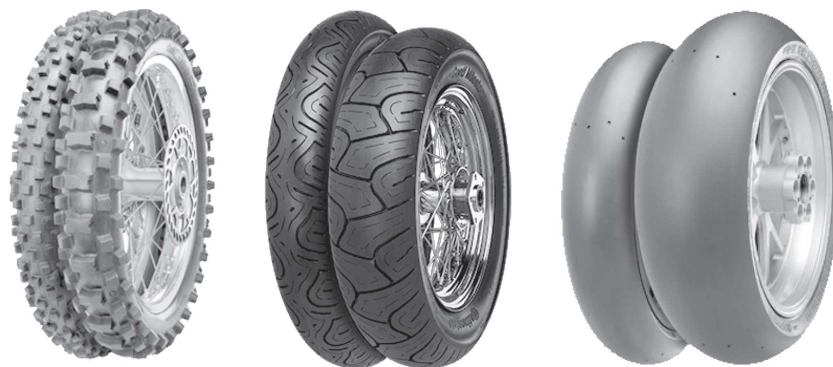
• Off Road • Cruiser • Racing Slicks

There are three main types of riding tires: Off-road, cruising and racing tires. Off-road tires have large, knobby treads suitable for gripping loose dirt and gravel. Cruising tires have smoother treads but also contain channels for displacing water and keeping traction in different road conditions. Racing slicks are completely smooth and provide the most traction in dry conditions for tight cornering. Some racing tires also have water channels for wet-weather conditions.