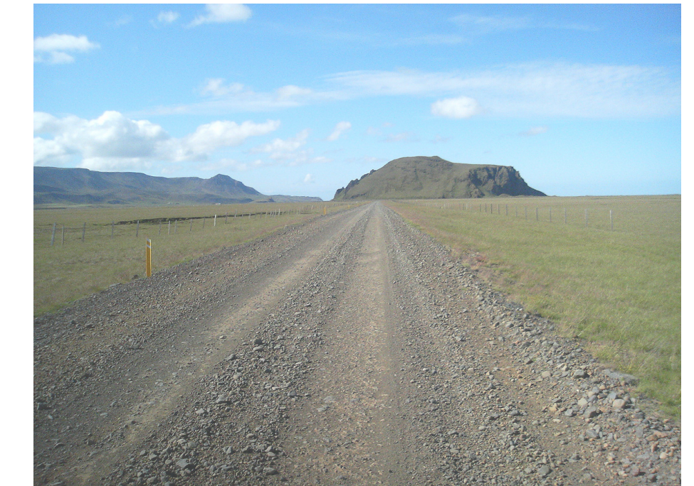
• Rough Terrain