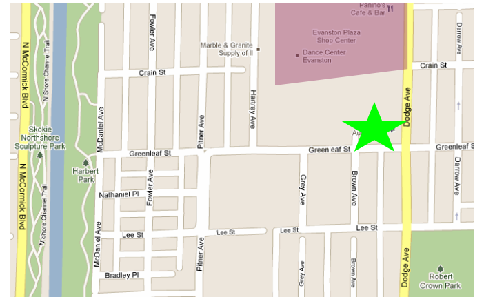
Dodge & Greenleaf, Evanston, IL 60202

Control from your smart phone or computer!