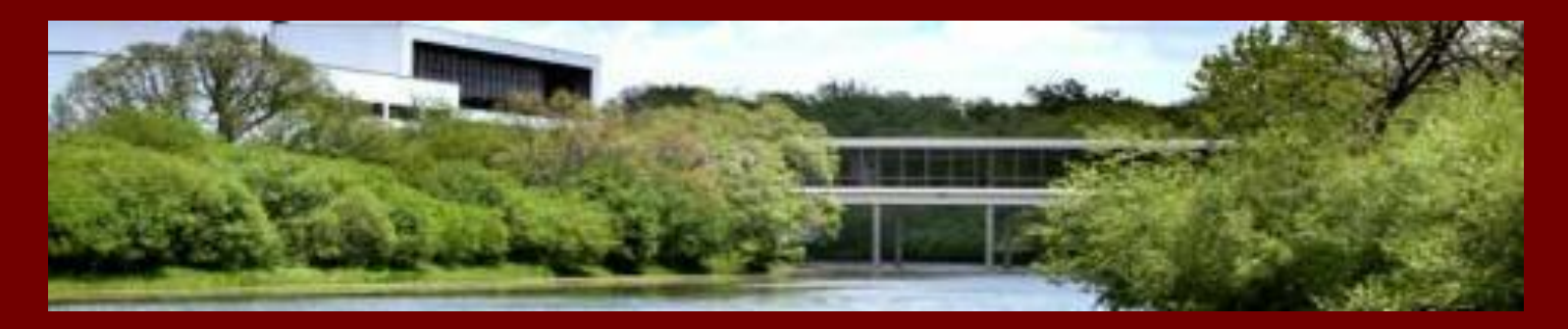
Joliet Junior College