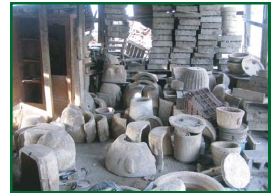
A workshop for potters in the village of Pesquería.

Involving local artisans in the fabrication process ensures economic expansion without creating a dependency on an external source. The process simultaneously empowers local individuals while generating income. They will be able to produce the clay filter and educate their potential market about the health issues related to water purity. The number of lives positively affected by the system and program will continuously increase because those who have been trained to produce the system can pass their knowledge to others via training of apprentices and peers between villages.