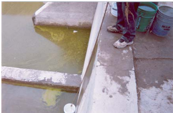
A rain tank filled with dirty and contaminated water in the village of San Luis Potosi in Mexico is the only local source of water for the villagers.

Numerous reports by the United Nations and the World Health Organization have indicated a significant worldwide problem with water pollution and accessibility to potable drinking water exists. Due to technological and economical barriers, the problem with water pollution is particularly more serious for under-developed and developing countries. Current water purification systems including sand filters, bio-filters, chlorination units, solar-based systems, and clay-based filters are branded globally as a means to address this problem. However, these systems have presented considerable limitations with their applications including high cost and lack of availability in rural areas. It is KlarAqua's mission to join worldwide efforts to supply those in need of clean potable water at a price they can afford.