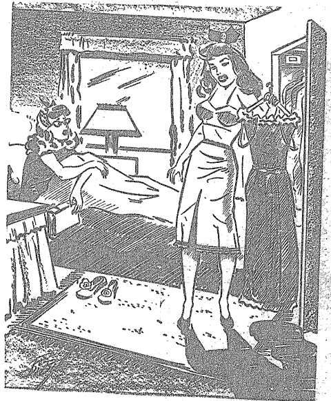
"This is your 'nightie,' Elio Mae — you've got on my street, dress again."

When not in use, the source is lowered by remote control into a grease pit which contains a lead safe with six-inch walls. In operation, the source is viewed with a periscope from behind a protective wall. Every precaution has been taken to protect staff members from dangerous radioactive rays.