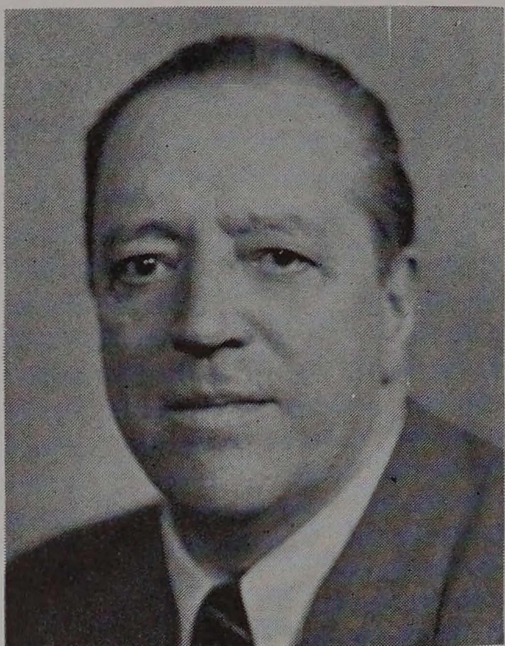
LUDWIG MIES VAN DER ROHE Director of Option of Architecture and Professor of Architecture Volksschule, Domschule, Sterdt, Gewerbeschule, Kunstgewerbe Museum, Berlin