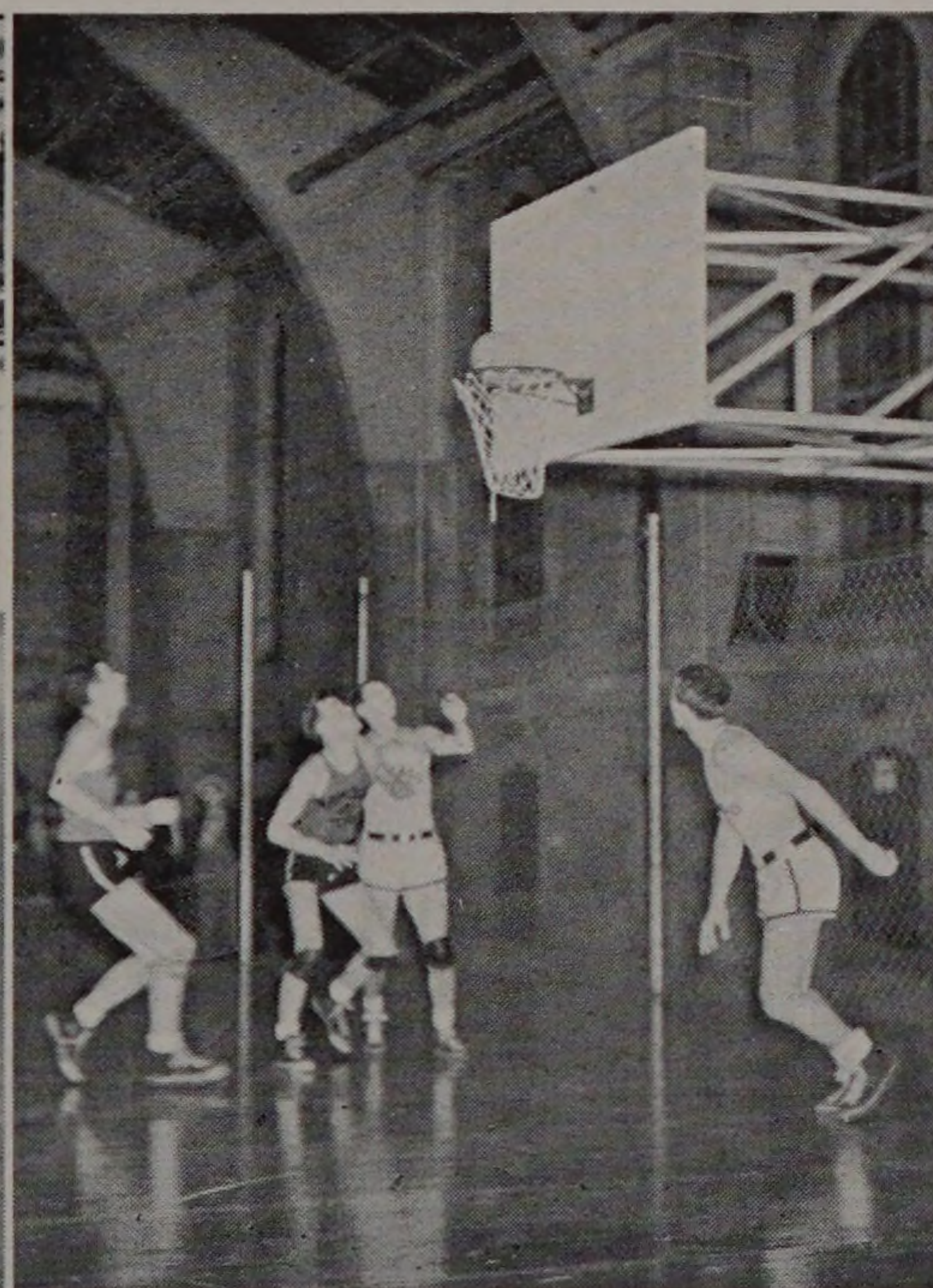
Get It Off the Backboard