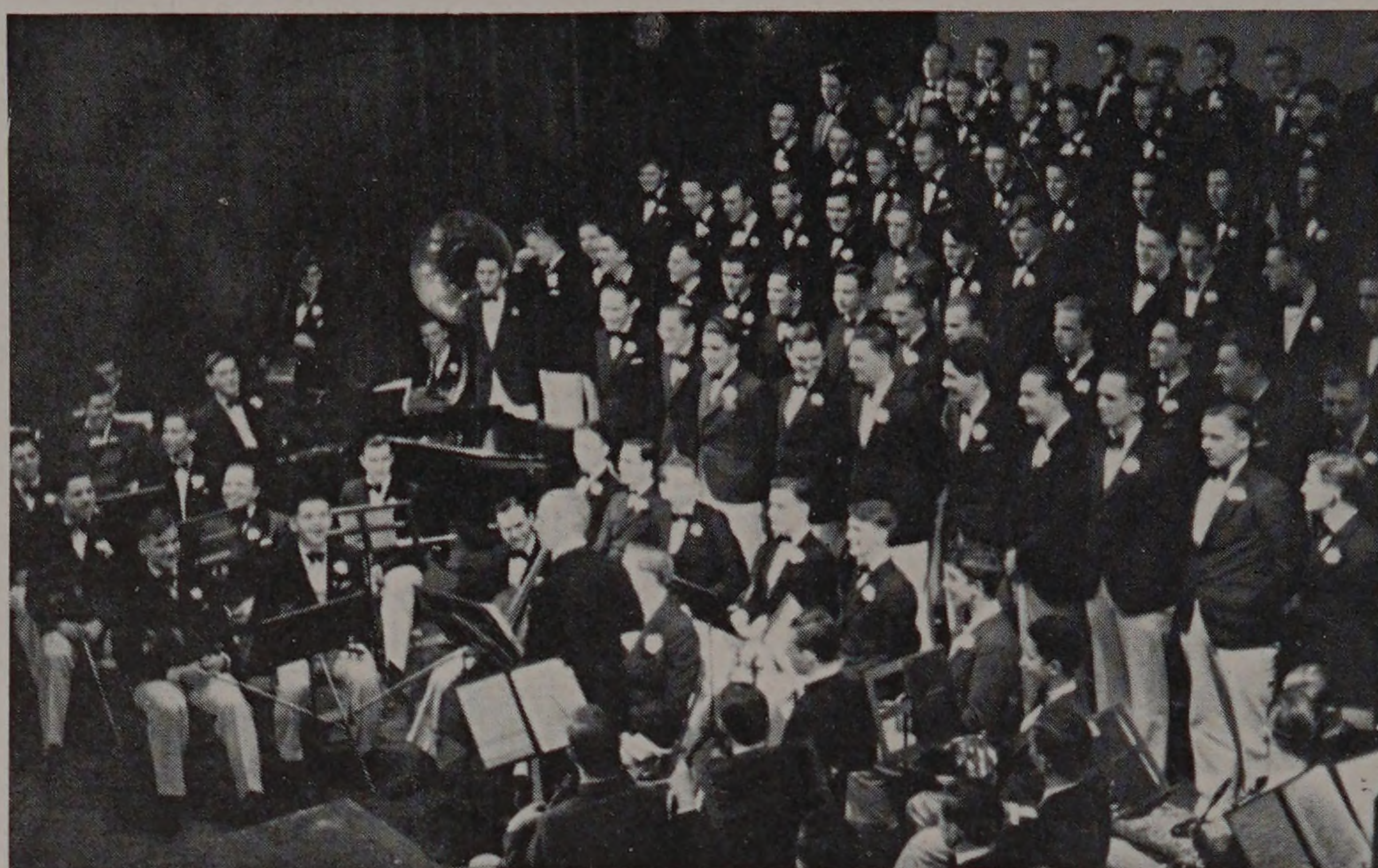
The Concert at the Goodman Theater