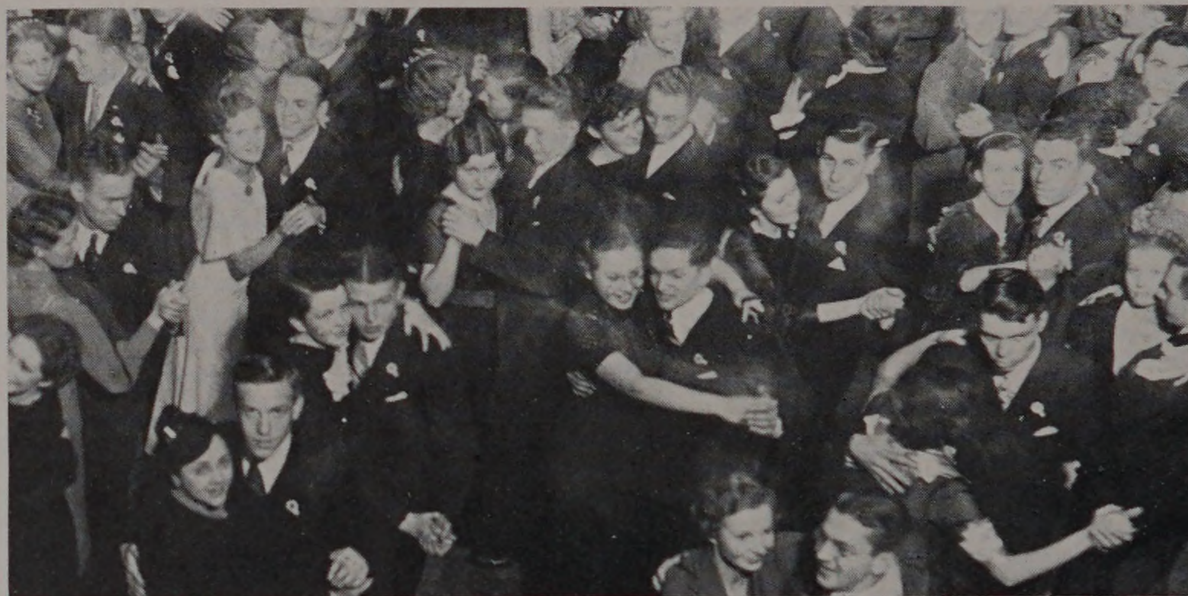
The Grand Ballroom of the Medinah Athletic Club

Armour social season was brilliantly launched by the class of '36 on November 29, 1935, when the Senior Informal, another of their highly successful dances, was presented at the Medinah Athletic Club. In giving the first dance of the year, the Seniors also closed their career in the field of class dances. The event was marked with their characteristic style, in that the bids were sold out several days before the dance. Everyone, it seemed, was desirous of attending the social premiere.