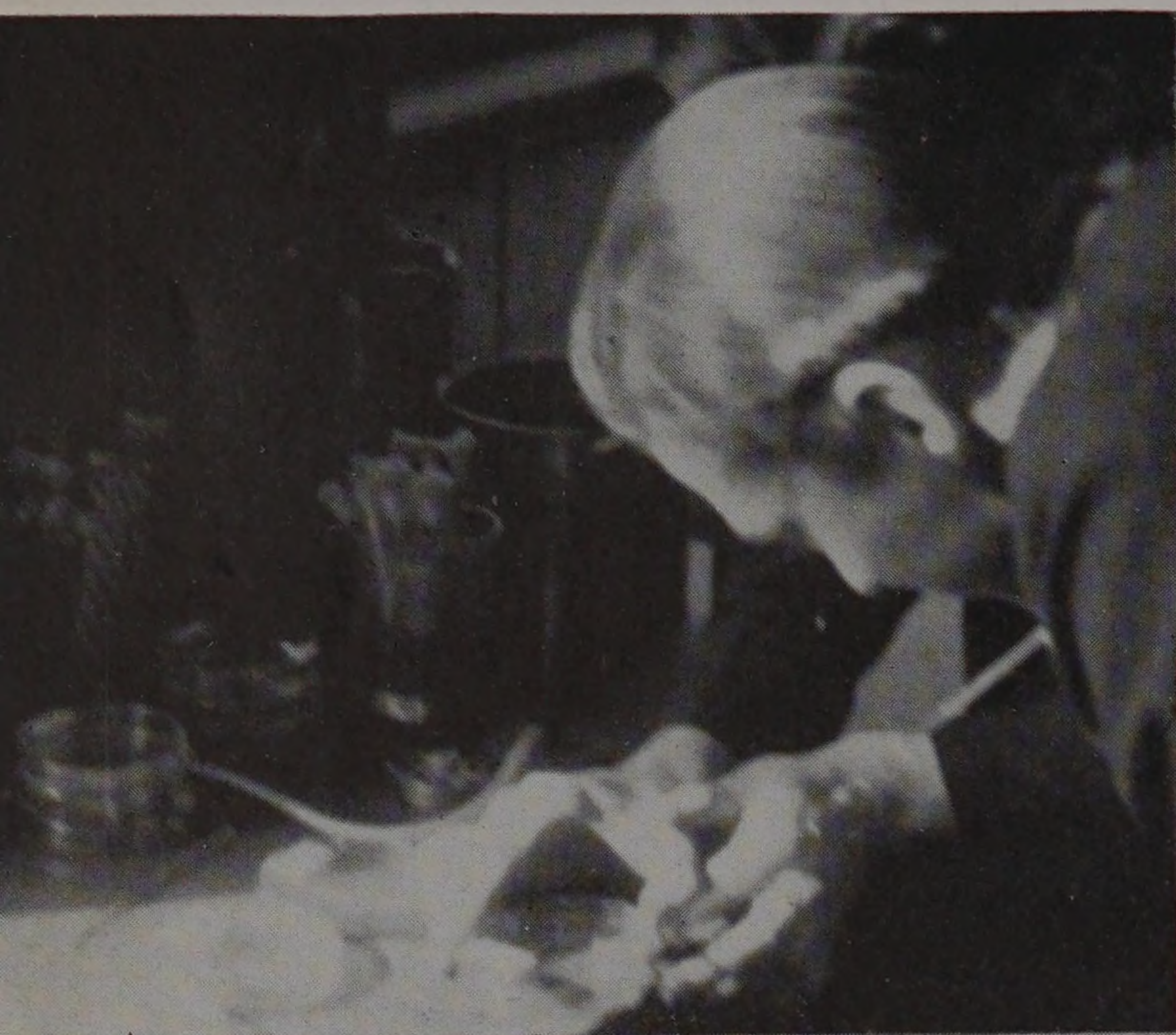
WONDER IF HE'S CALIBRATING THAT PETRIE DISH?