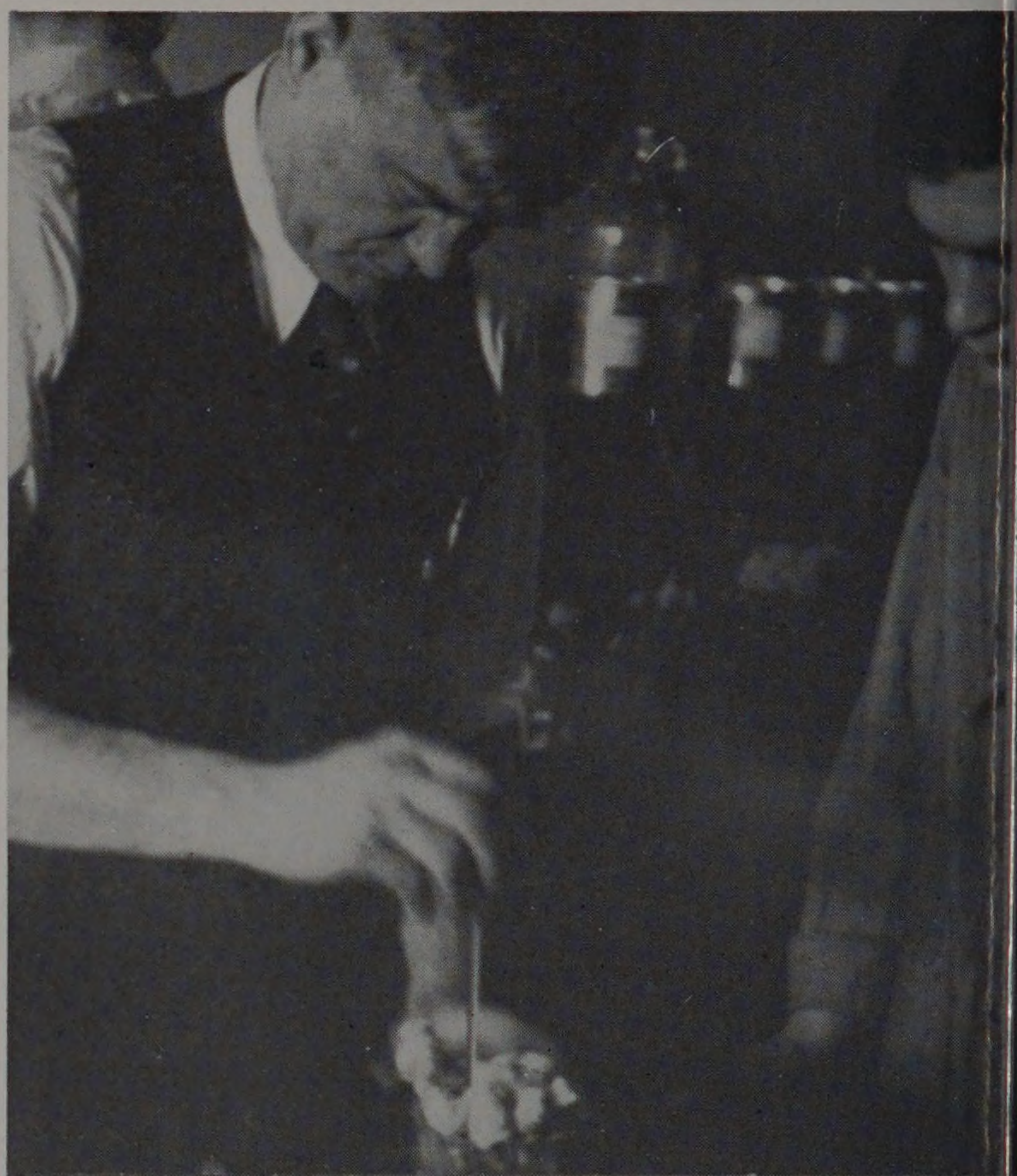
DON'T BURN YOUR FINGERS ON THE COTTON, JOH