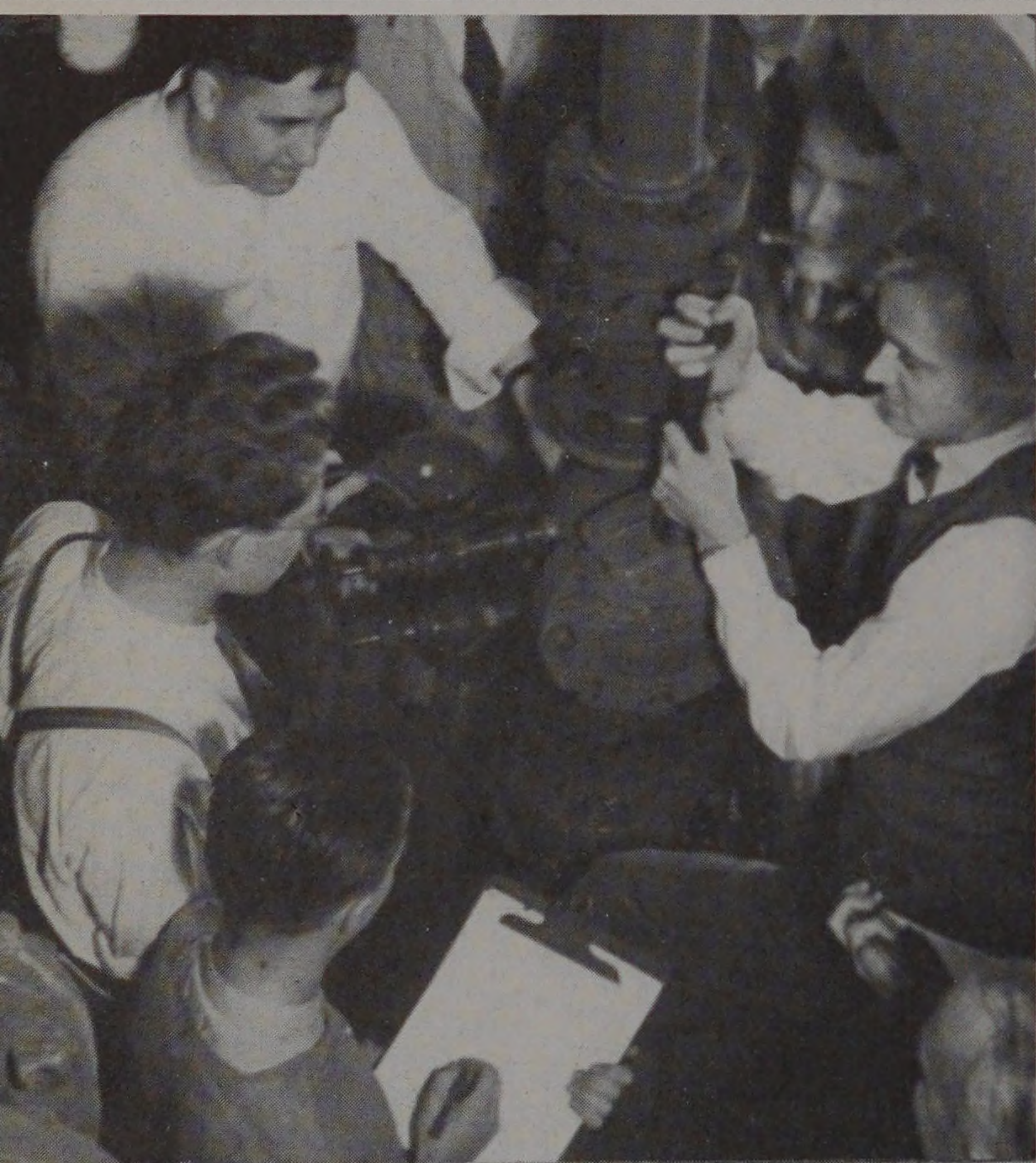
RE PROTECTS FOOL THE PHOTOGRAPHER BY WORKING