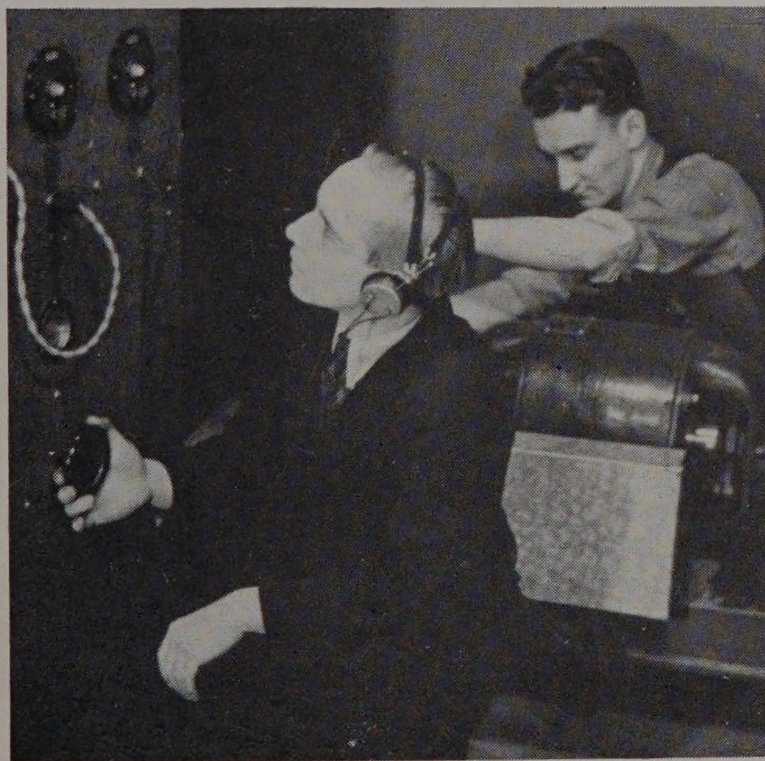
The Boys In The Radio Club At Work

Now as we are nearing the middle of our college course and upperclassmanship, we can look both backward and forward. Backward to the fun, work, and comradeship that we have enjoyed in our stay at Armour up until this time, and forward to specialized engineering and the end of our college career.