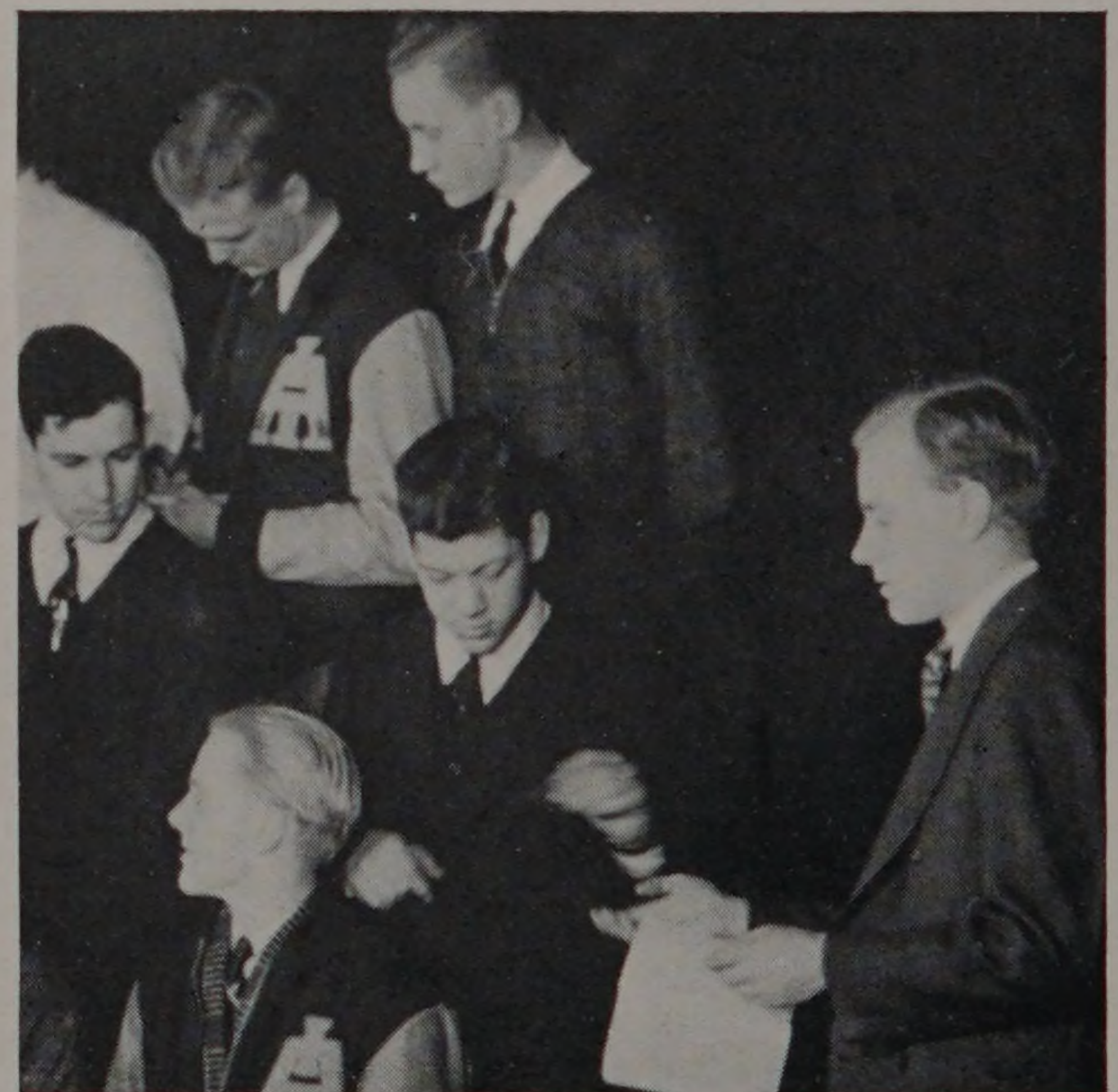
The Sophomores Have Their Pictures Taken For The Cycle