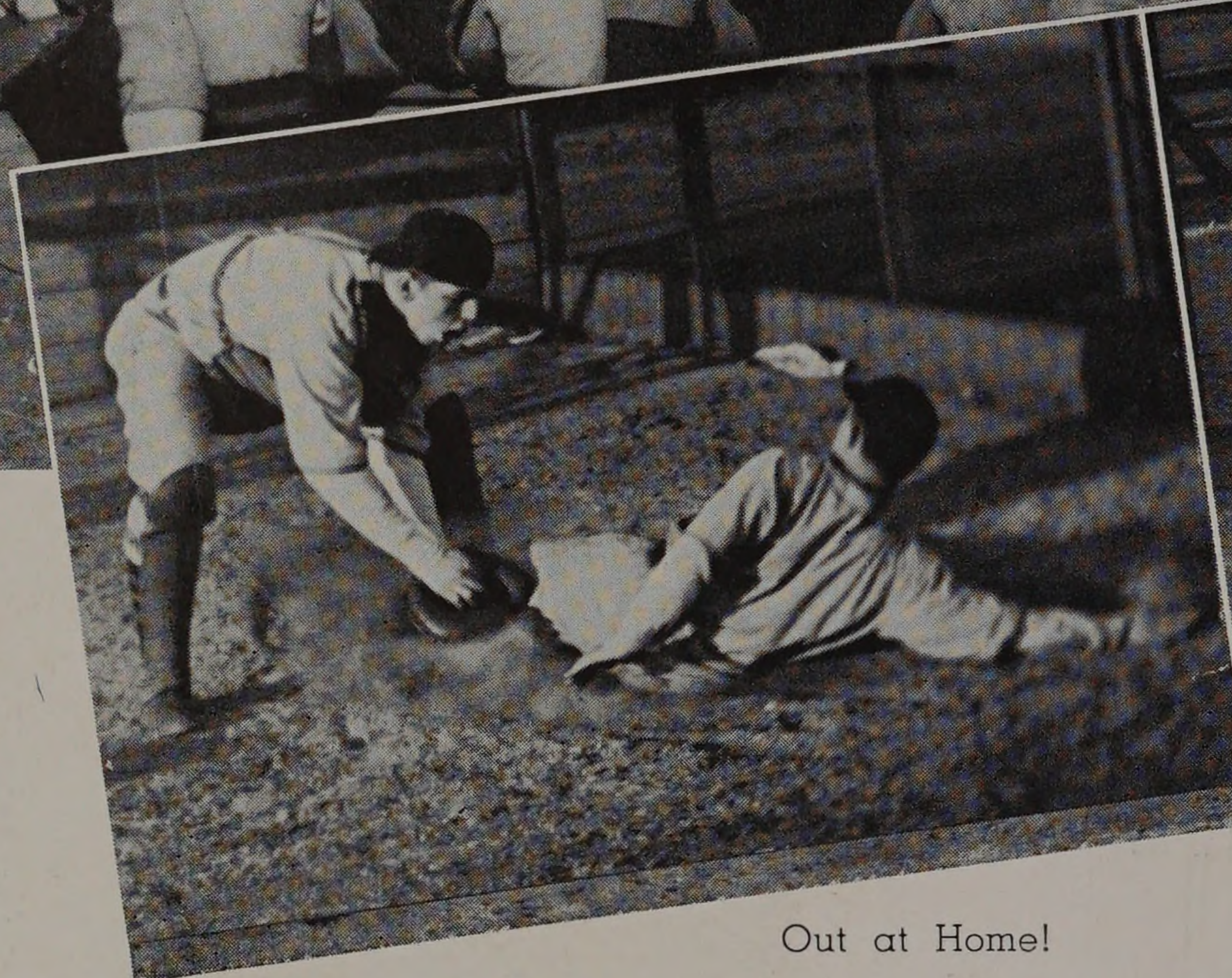
Out at Home!