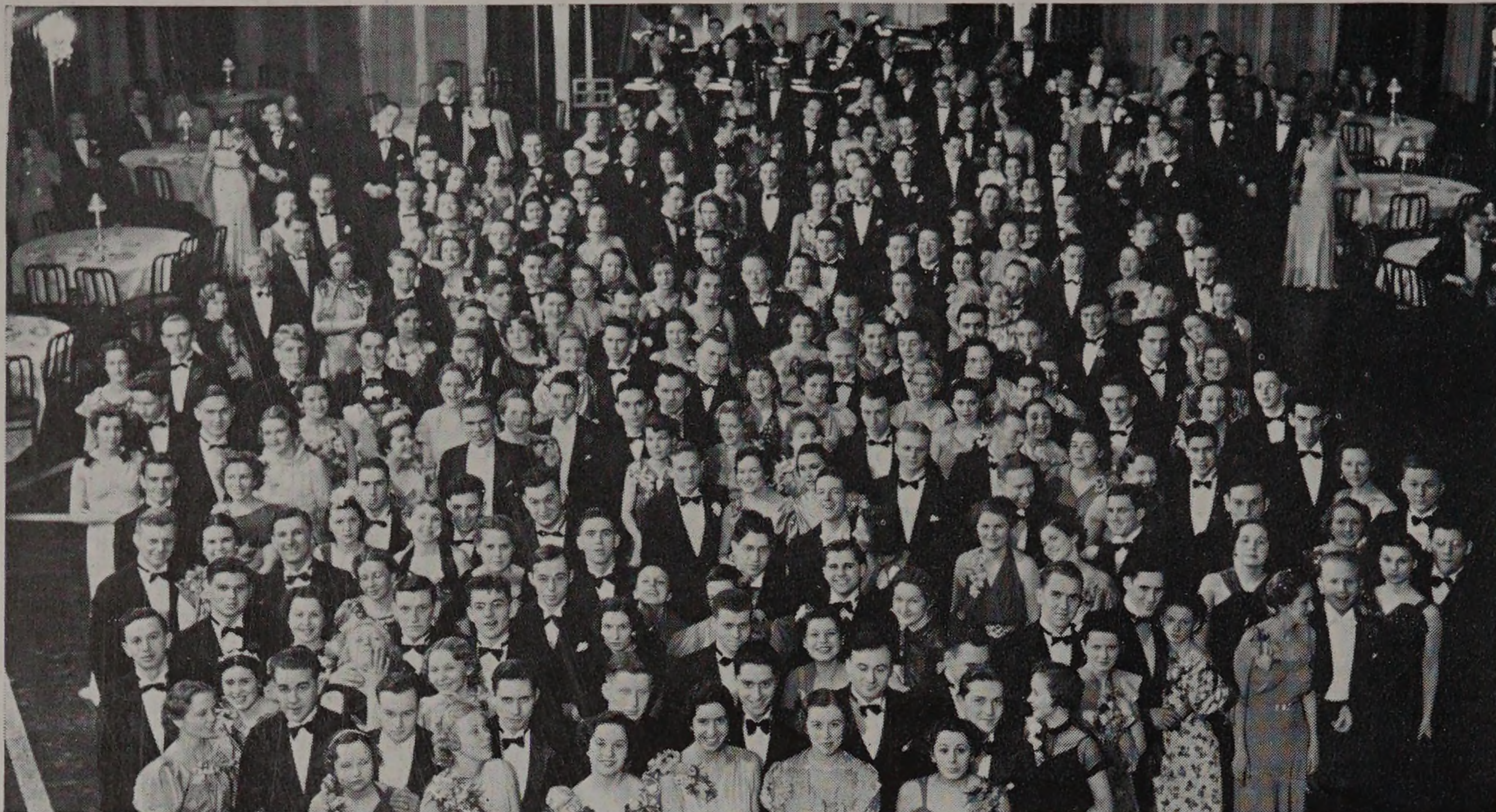
The Junior Formal at the Drake Hotel