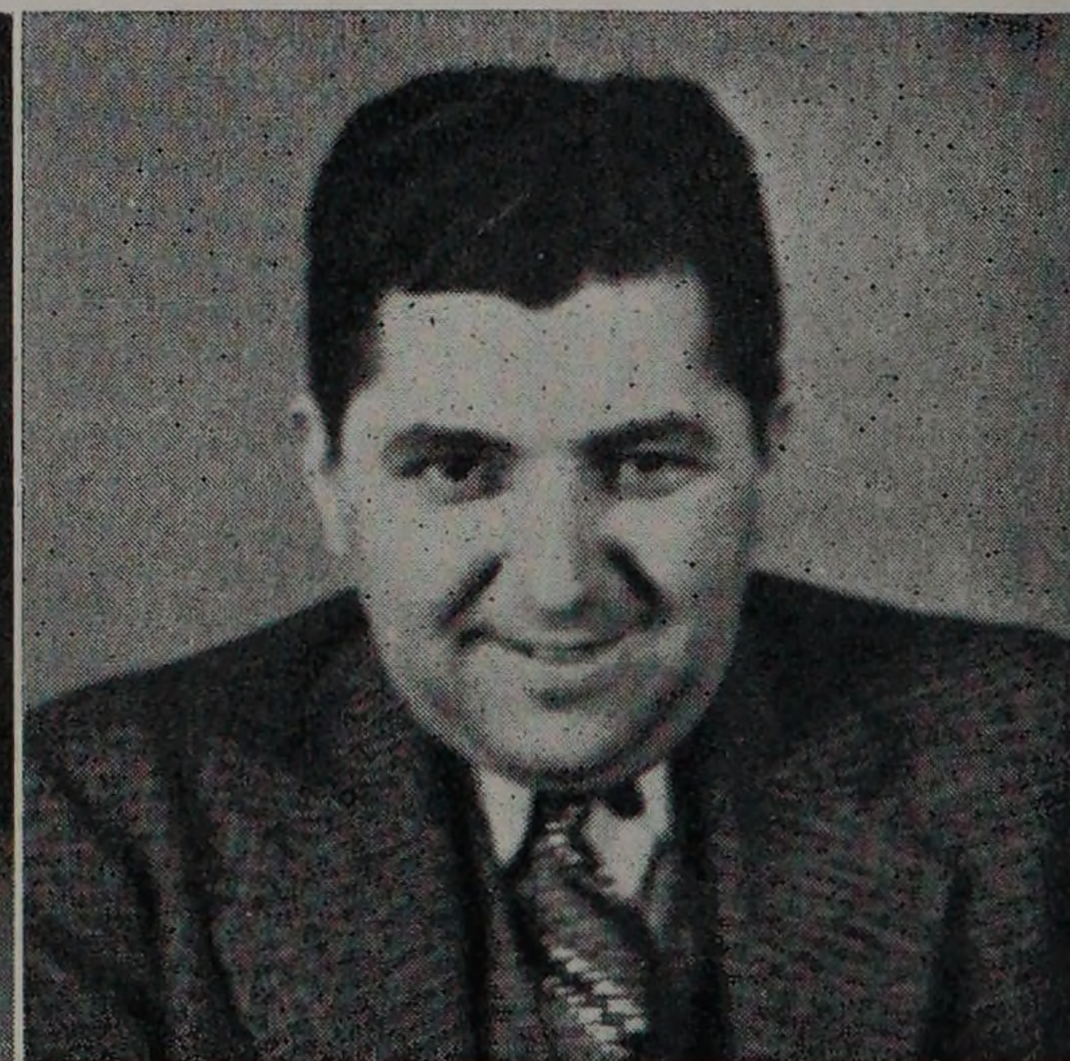
"Well, I'll Tell You——"