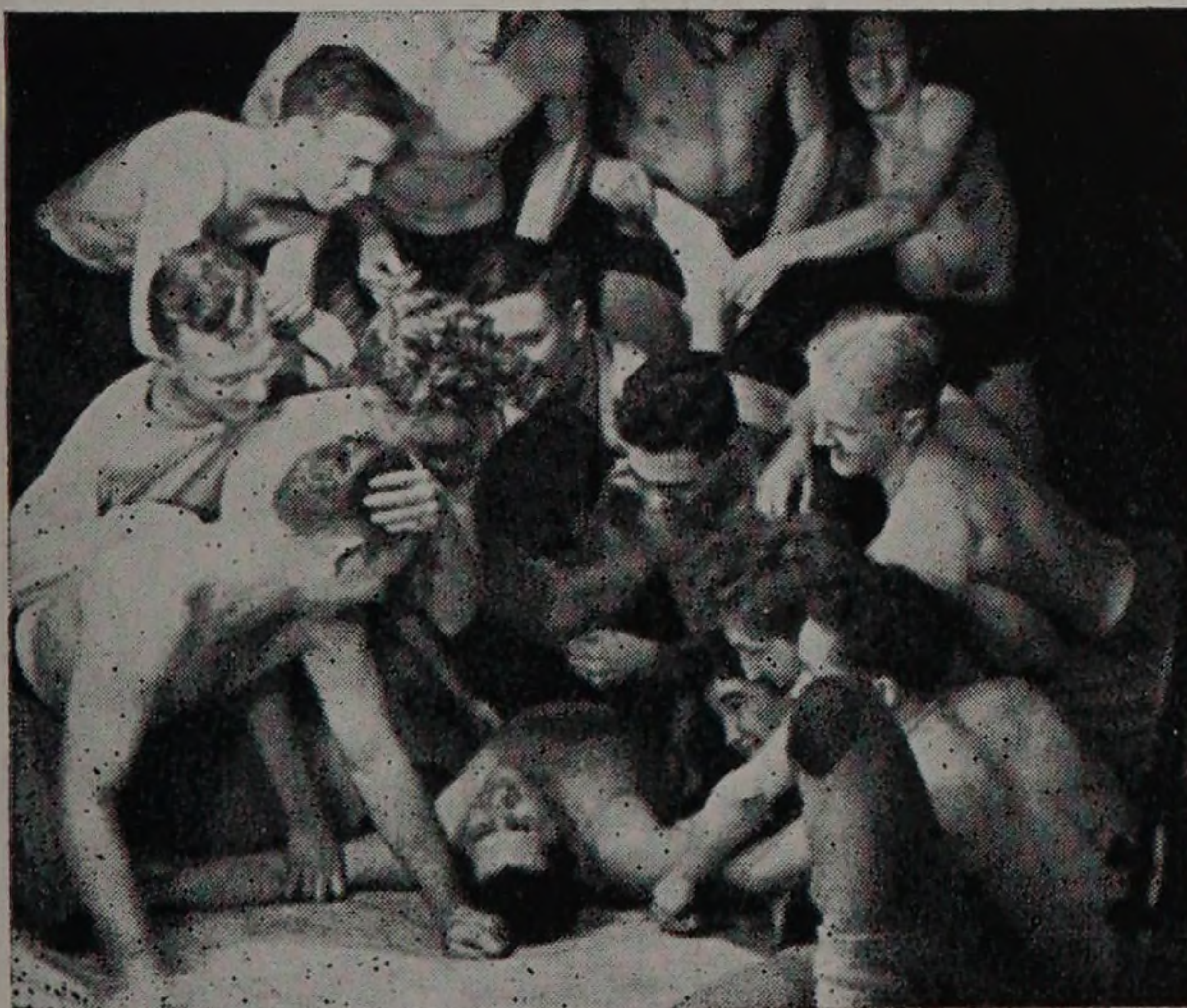
Teach Us Something, Coach