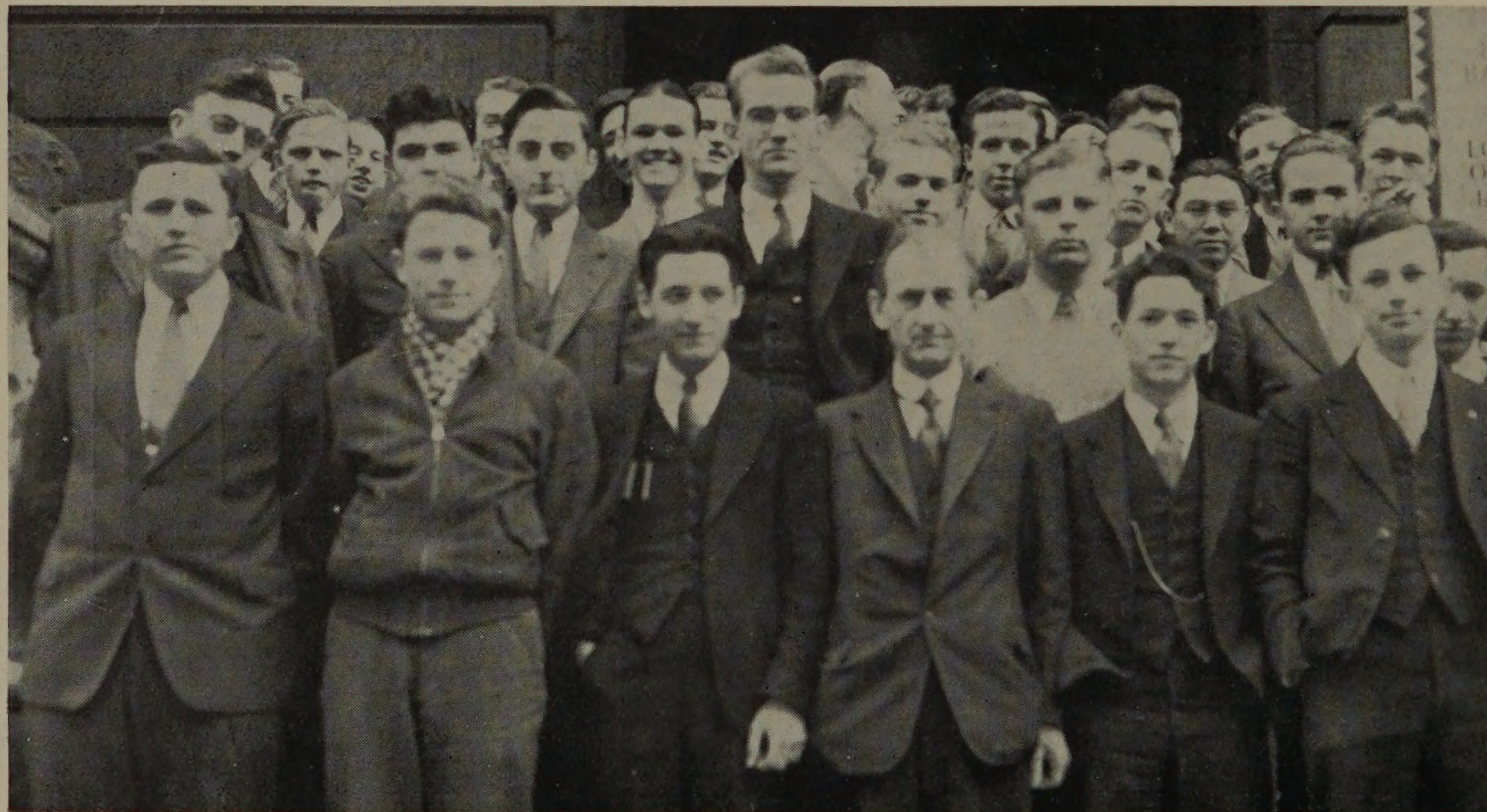
At the Art Institute with the Architects

Probably the most eventful occasion of the year for each freshman class has been its initiation into the society. Some time after Junior Week a date is designated as Hell Day, the evening of which has been previously selected for the annual banquet. In the morning the freshmen are given a sketch problem to be finished by noon and judged by the junior class in the afternoon. After their lunch they are appointed to gather on the porch of the Art Institute attired in their green hats, work gloves, a stocking muffler, and whatever else pleases the whims of the upperclassmen. They are marched into Grant Park, and from then on their troubles really begin. The great God of Architecture exacts many duties, and the culprits return, purified and chastised, from the field of honor, the proud possessors of a fellowship in the Armour Architectural Association. The evening banquet concludes the program.