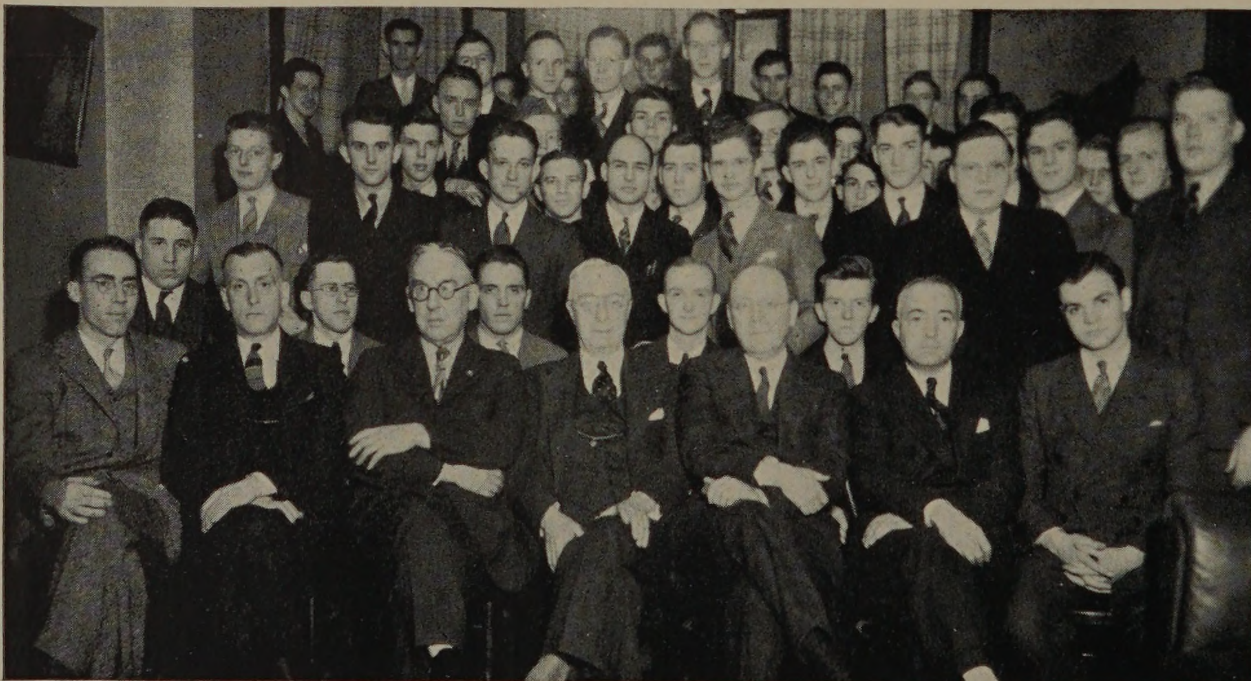
F.P.E.S. Smoker at Beta Psi House