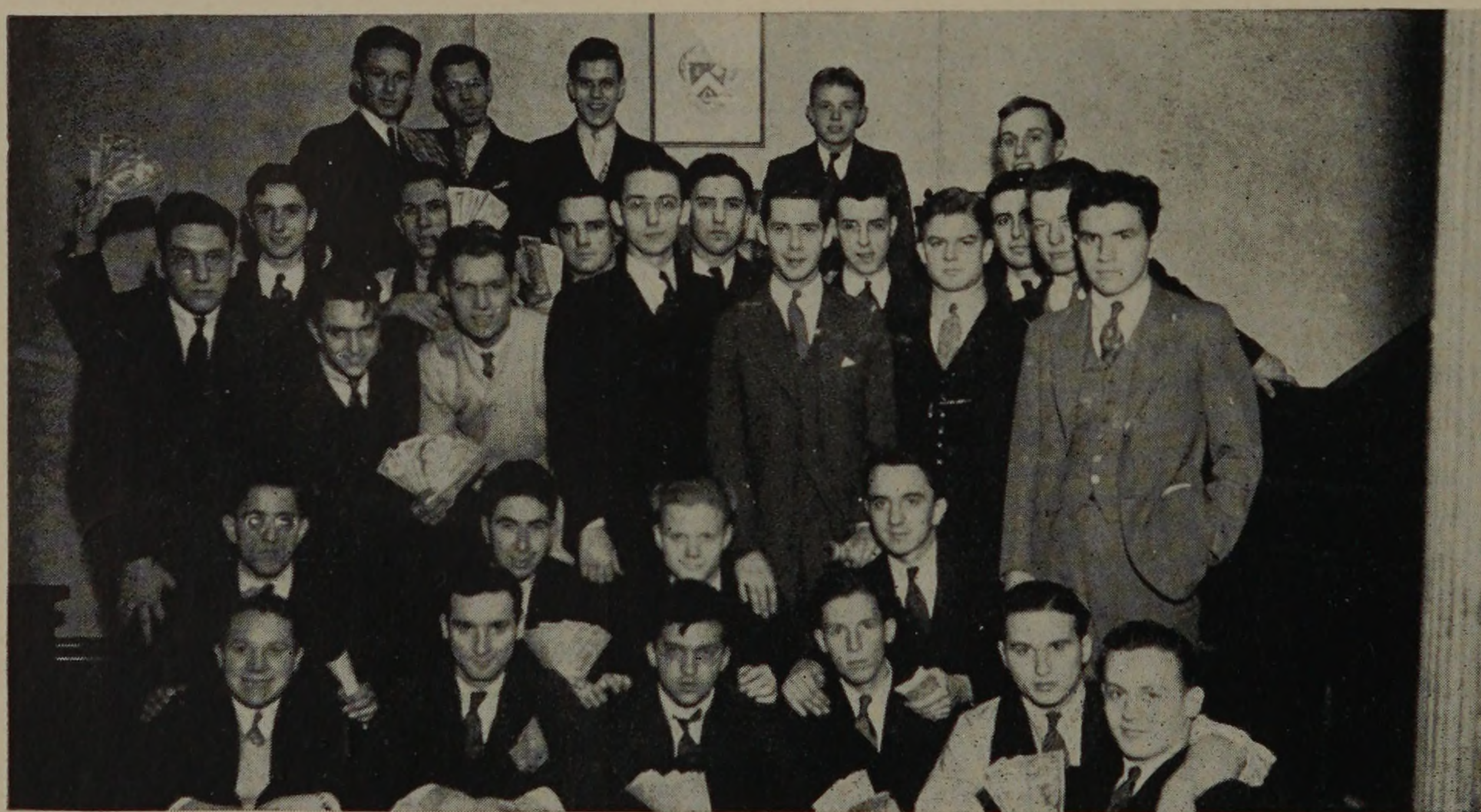
W.S.E. Smoker at Triangle House