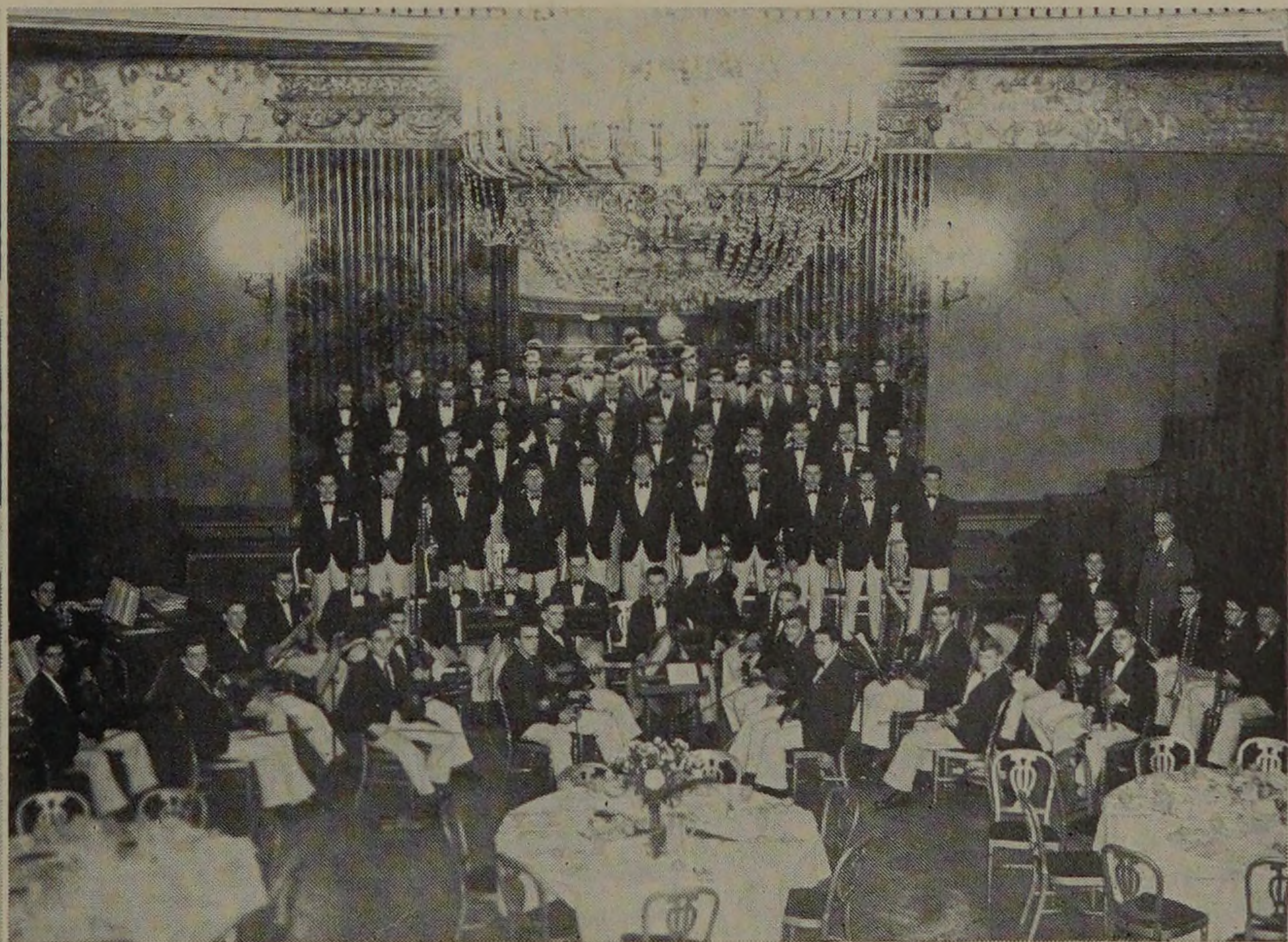
At the November Alumni Association Banquet at the Medinah Athletic Club