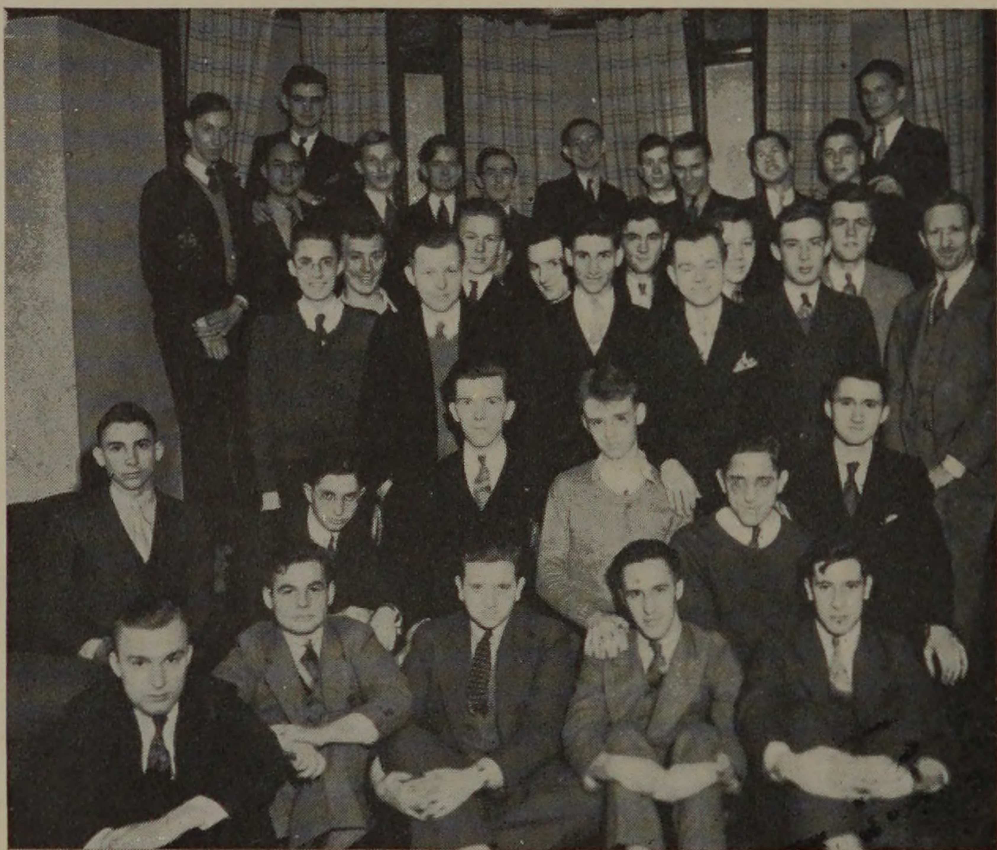
Tech News Smoker

Editorially, also, the "News" has been active. Its policy in general has always been to support whatever seems best for Armour. Among its activities is the sponsorship of a greatly increased program of intramural sports.