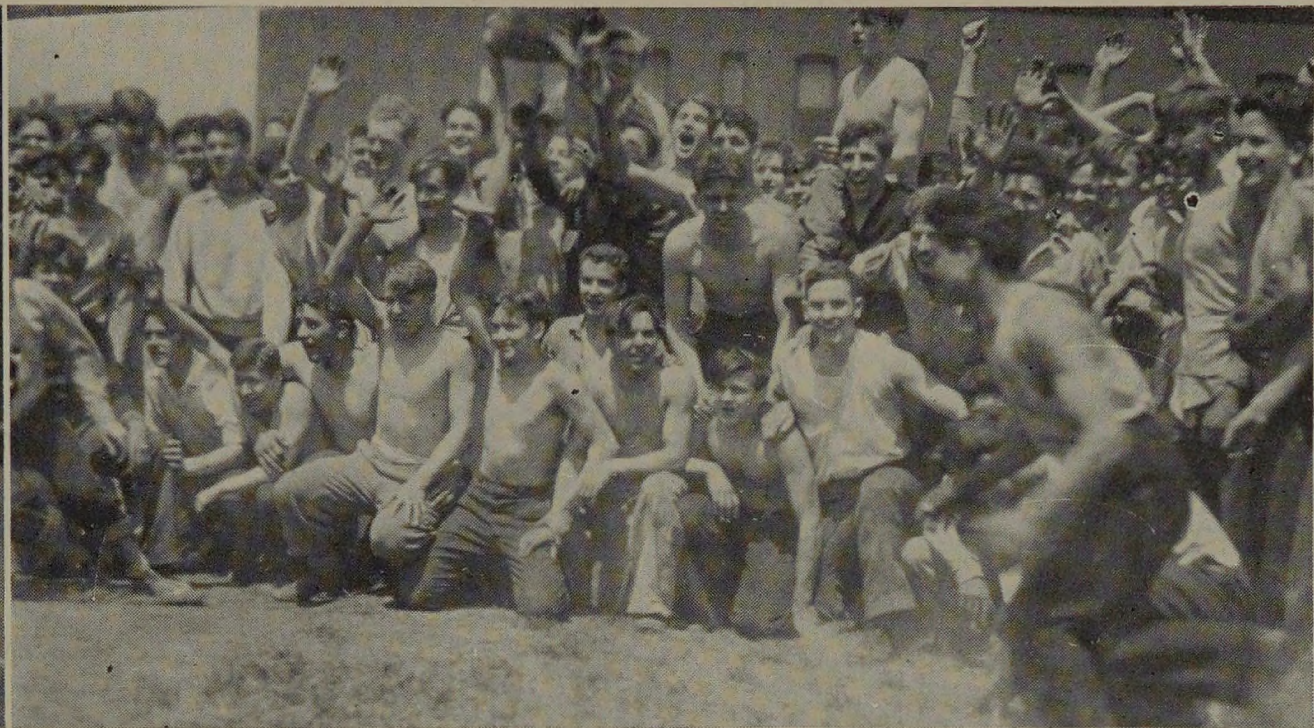
The sophs sure look happy over winning the rush