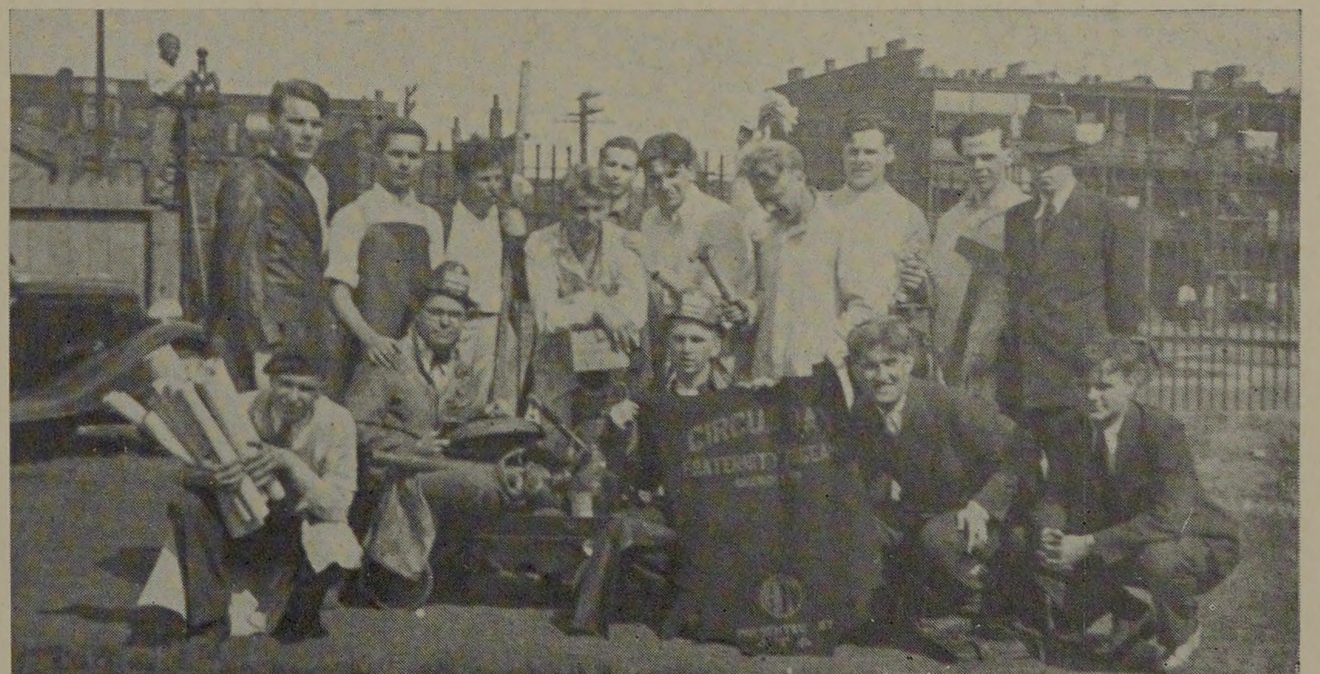
Winners of the Interfraternity Pageant, the Phi Kaps