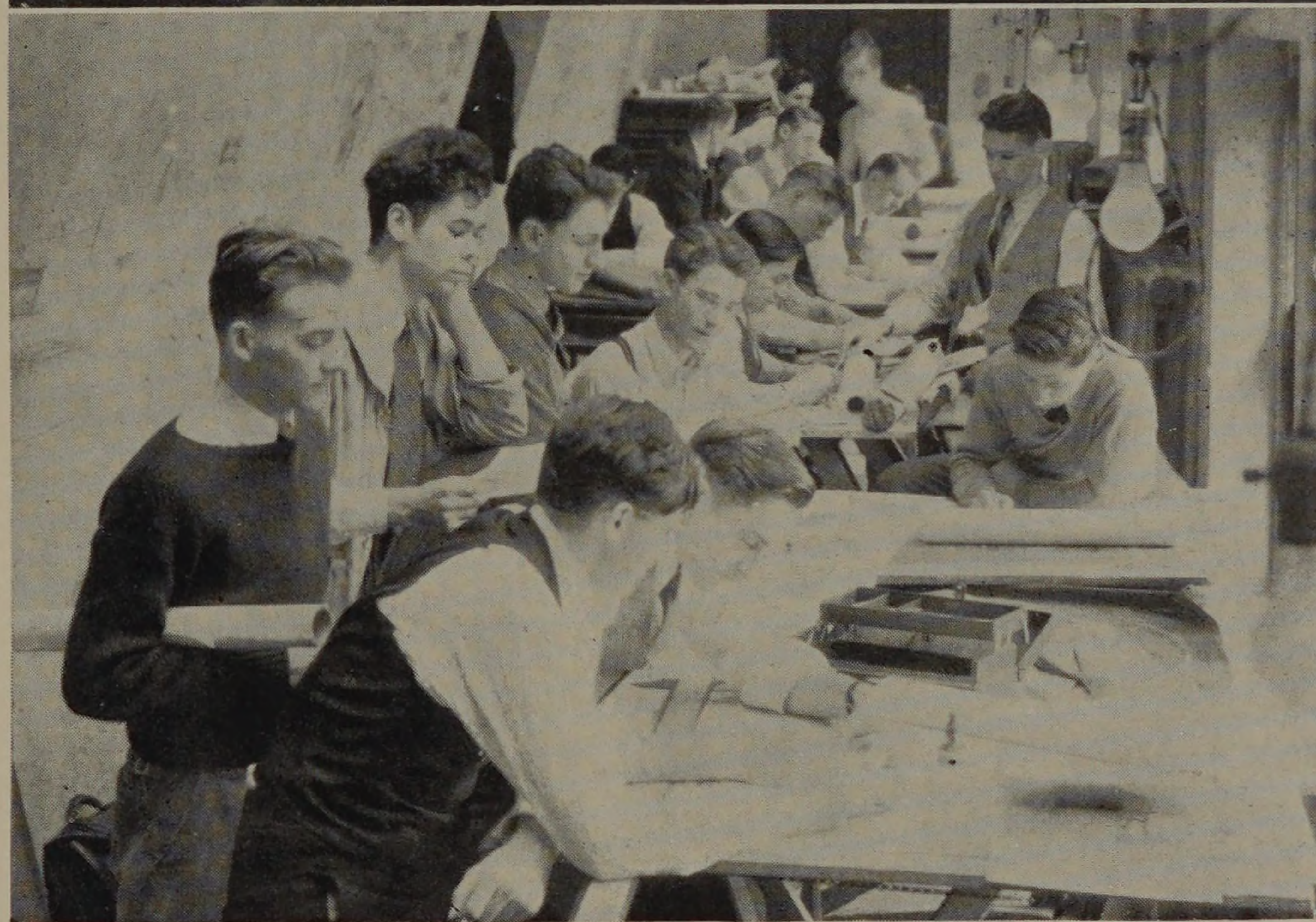
These sophomores seem be in a lot of heat in the Physics lab. . . . Looking down the line in the sophomore room at the Art Institute the day the projet is due.