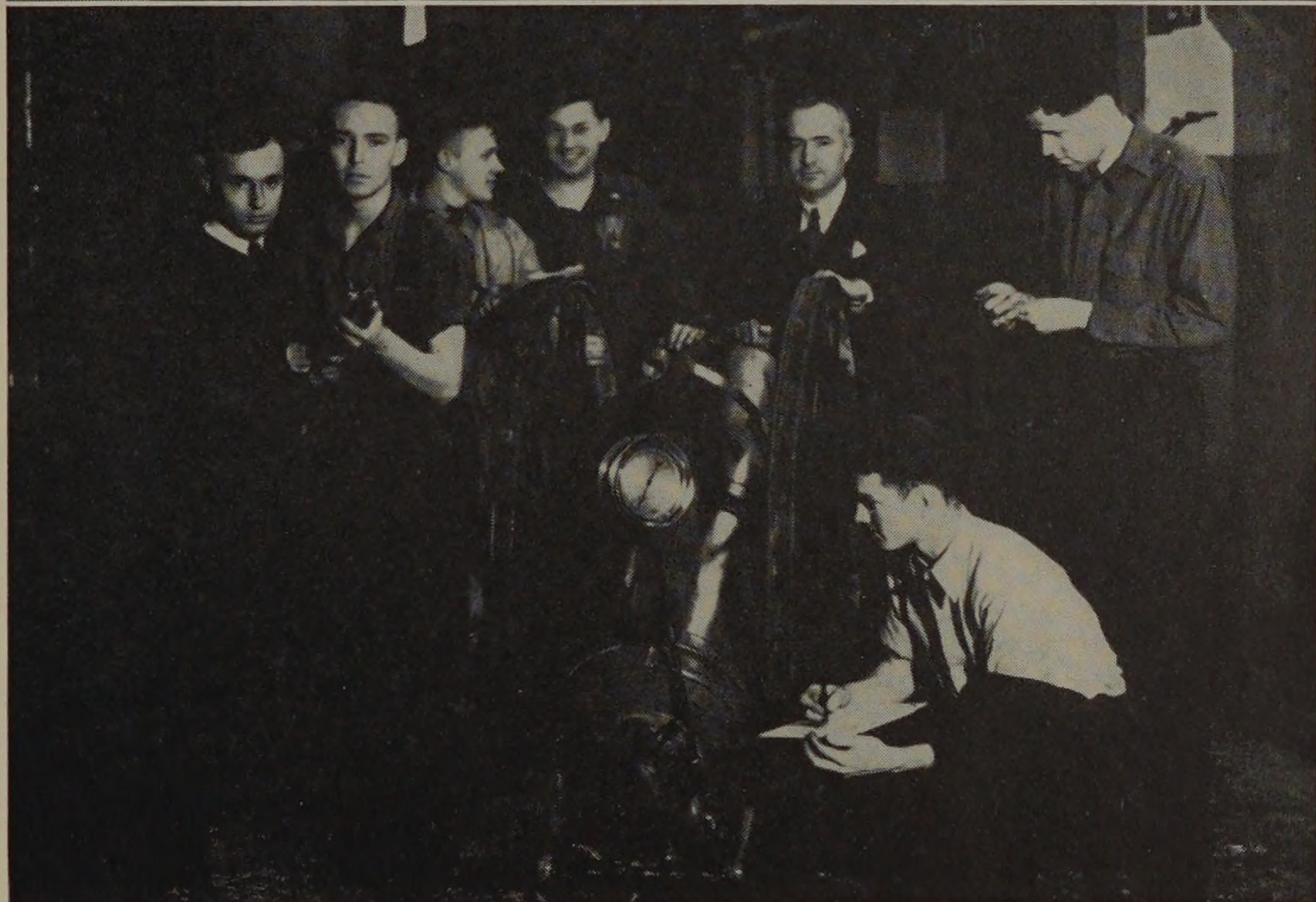
Just a regular day's work in the Materials Testing Lab for the Junior Civils. . . . Junior Fire Protects running test on 33-gallon soda-acid fire extinguisher at Underwriters'.