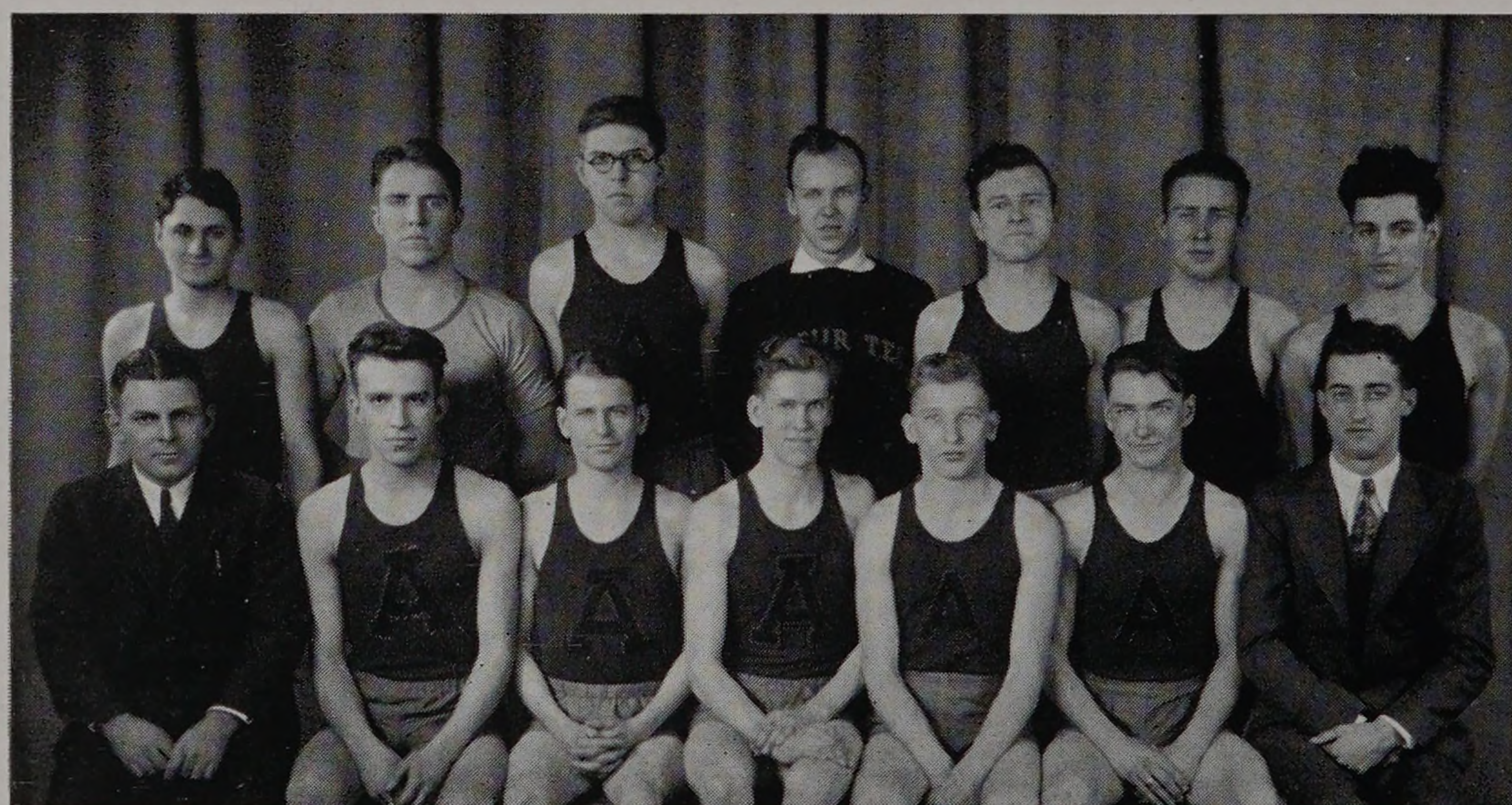
The 1933 Outdoor Track Squad