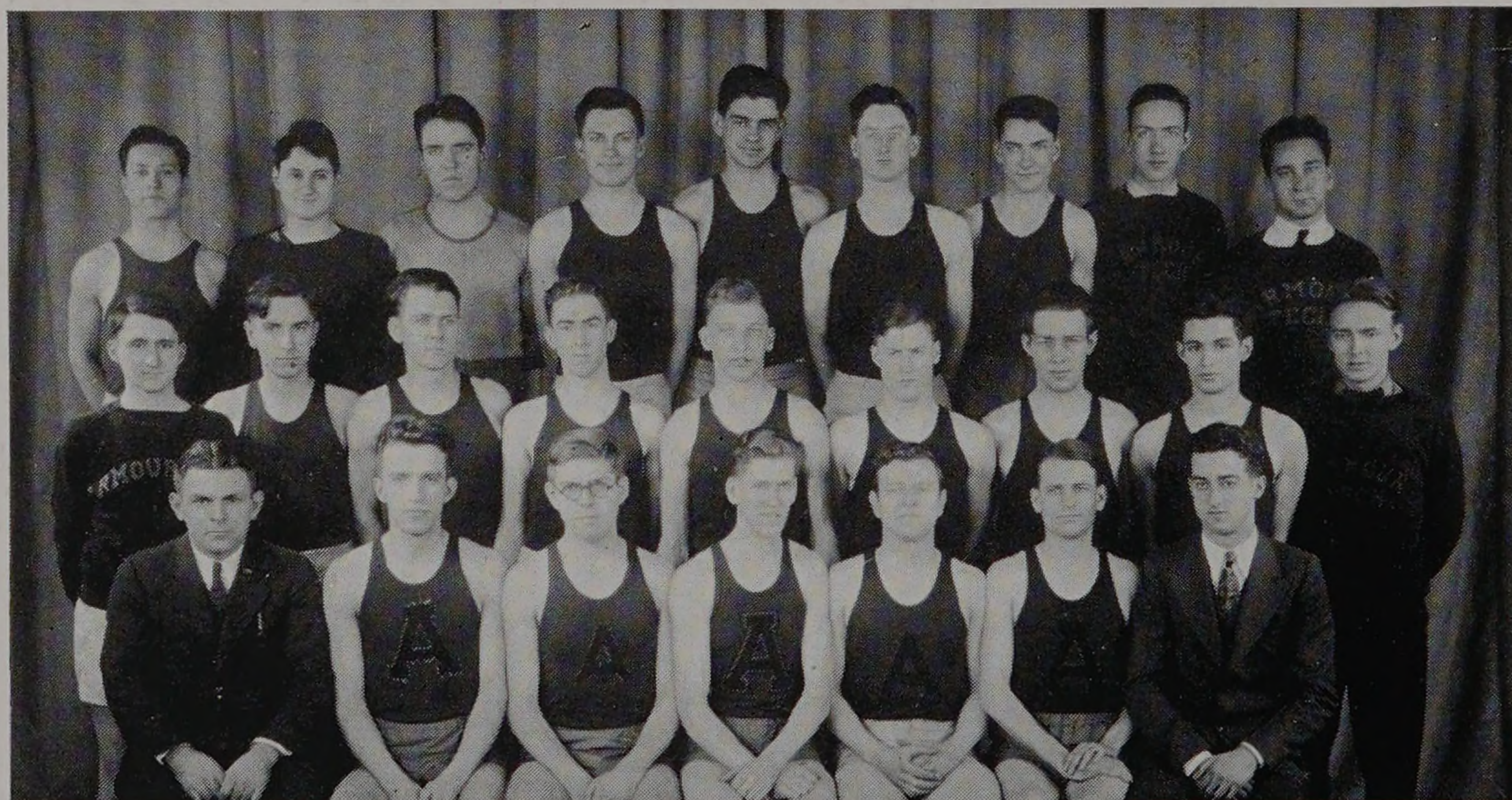
The 1934 Indoor Track Squad