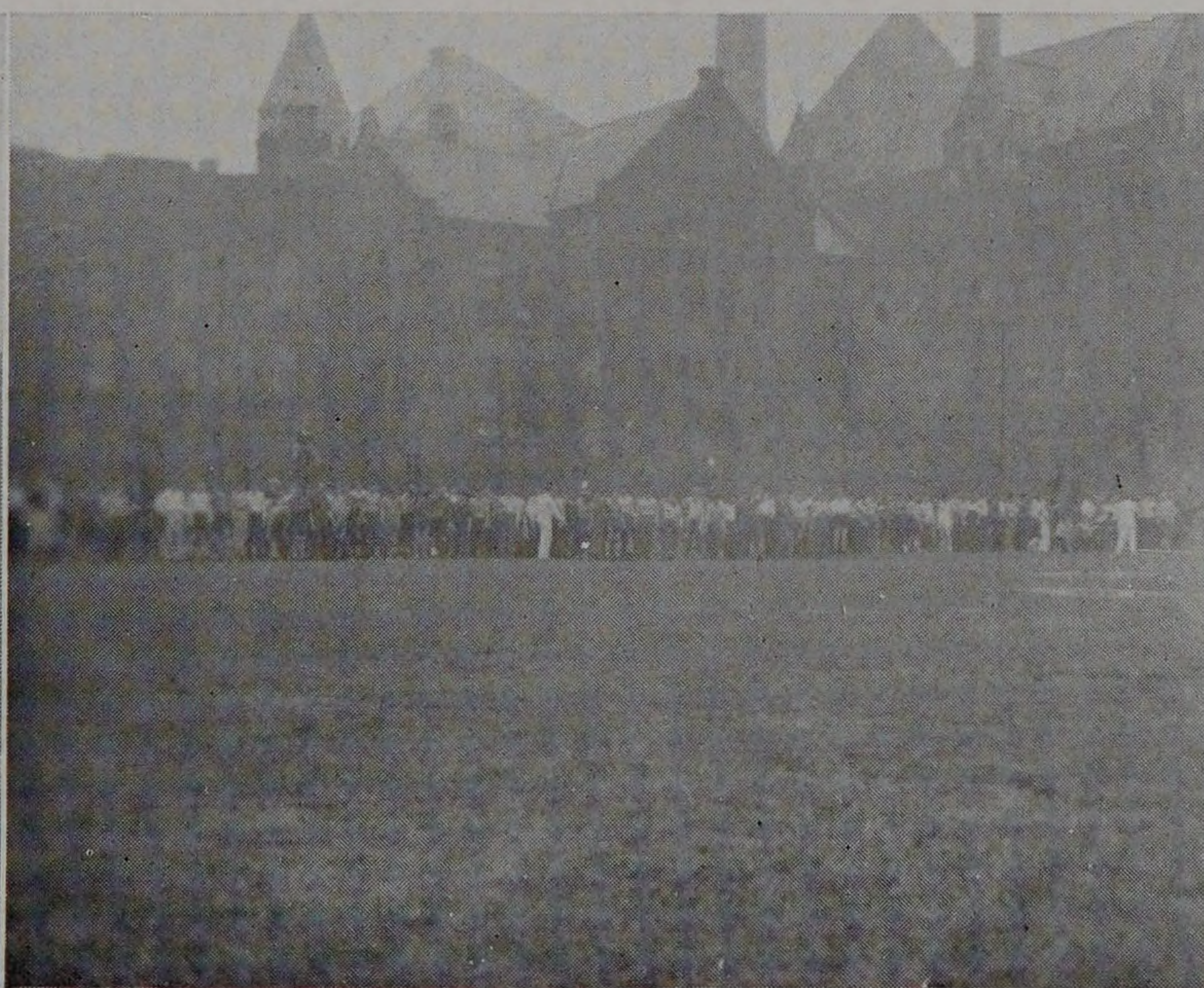
Before the Whistle,